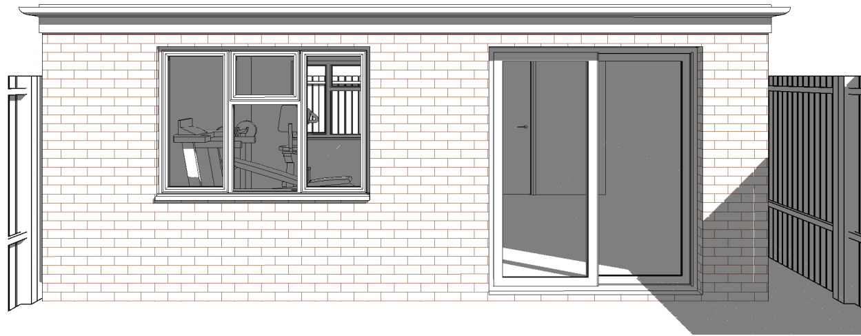
PP-PROPOSED FRONT VIEW 2