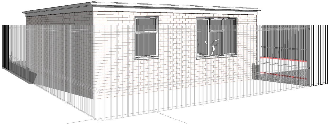
PP-PROPOSED REAR VIEW 2