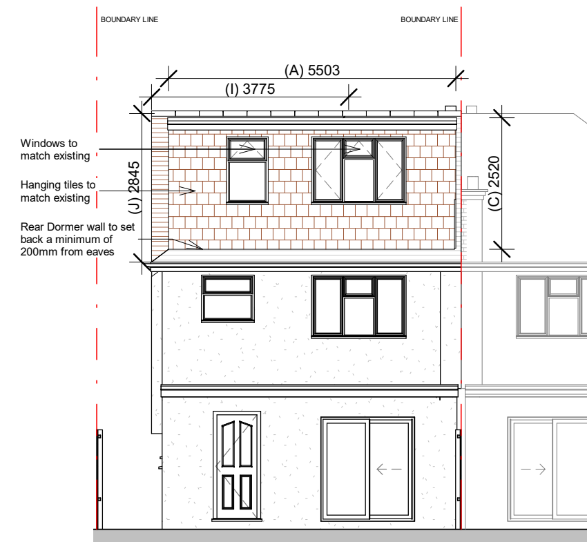
PP-PROPOSED REAR ELEVATION 1 : 100