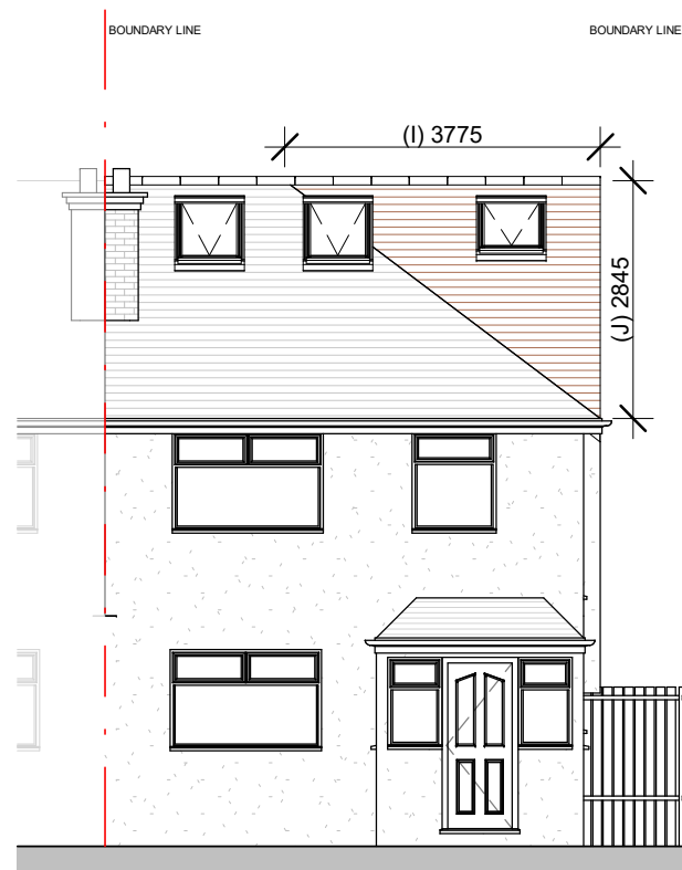
PP-PROPOSED FRONT ELEVATION 1 : 100