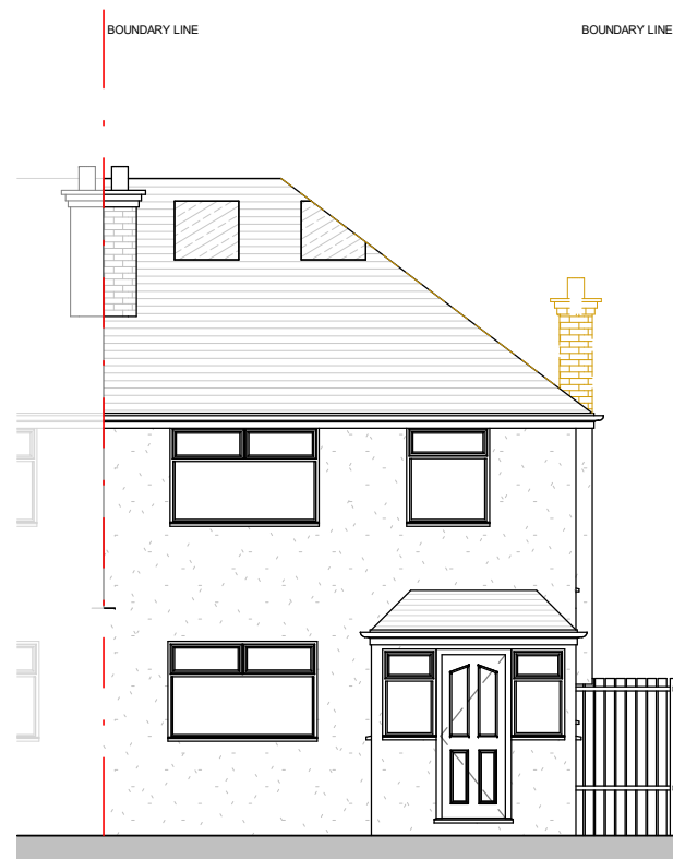
PP-EXISTING FRONT ELEVATION 1 : 100