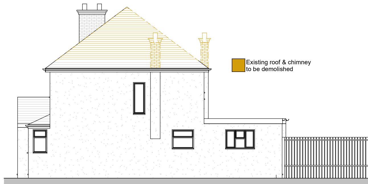
PP-EXISTING SOUTH SIDE ELEVATION 1 : 100