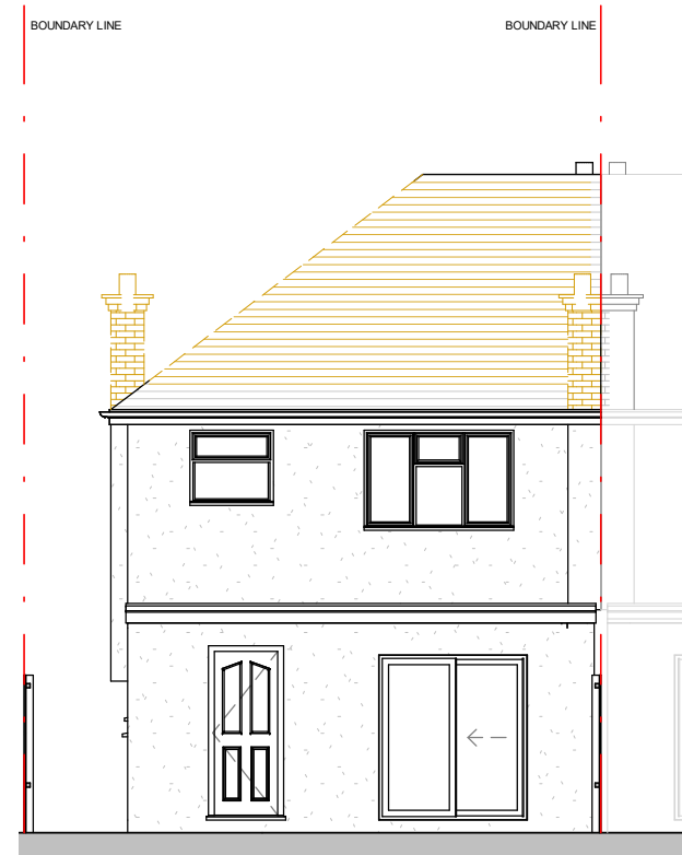
PP-EXISTING REAR ELEVATION 1 : 100