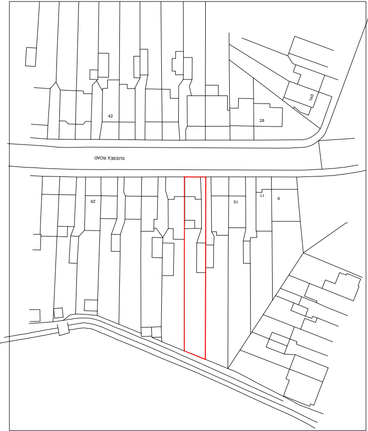
SITE PLAN 1:1250