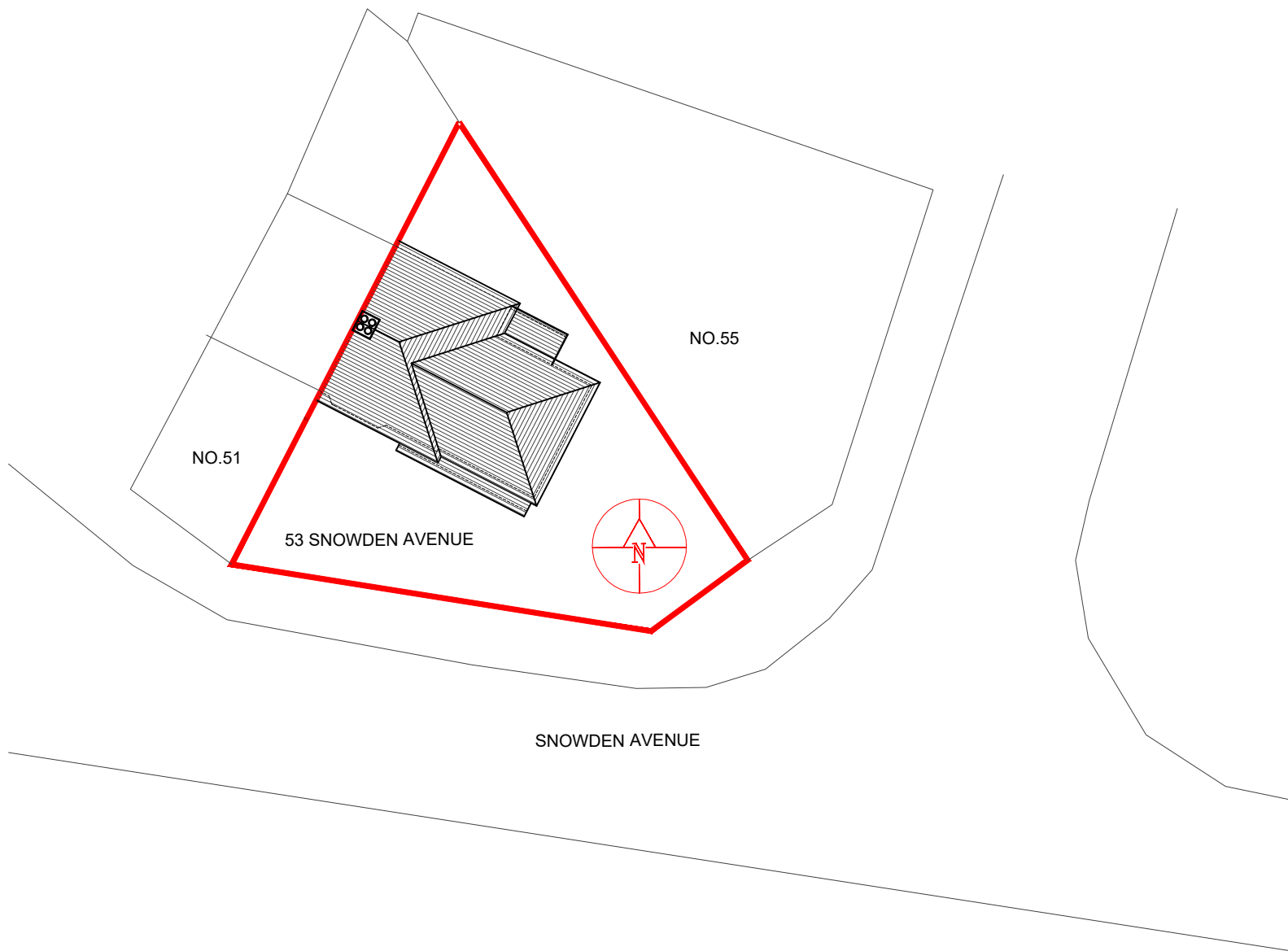
01 -EXISTING & PROPOSED BLOCK PLAN