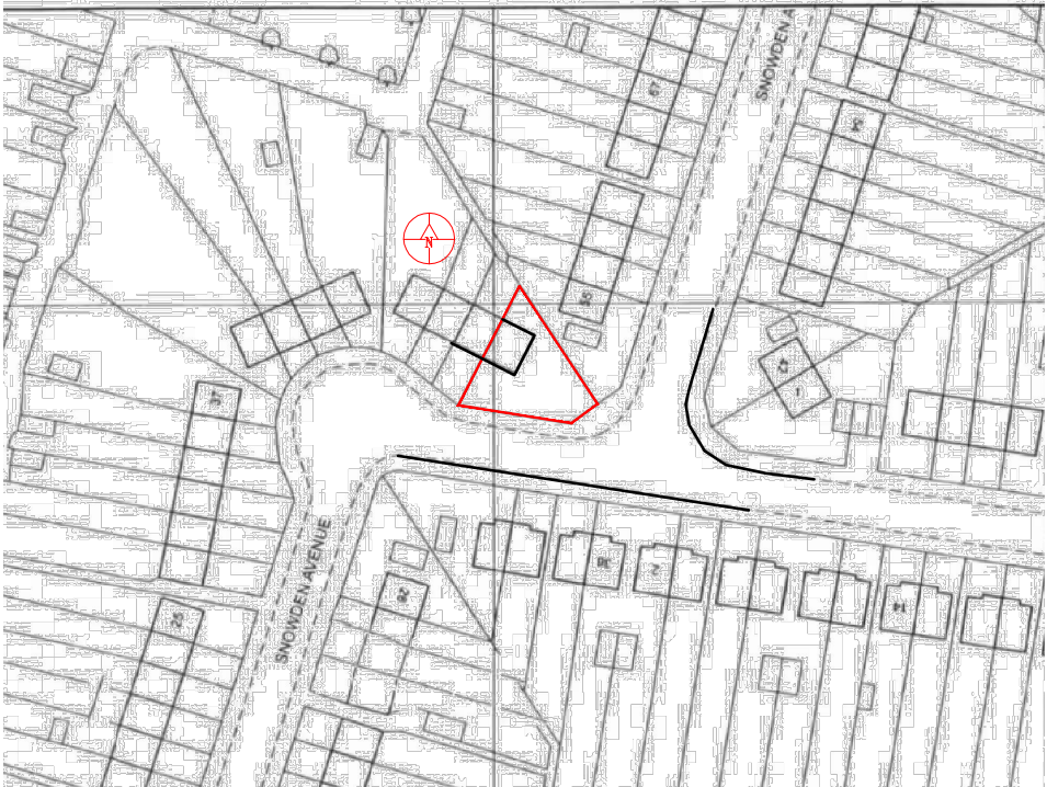
02 - OS MAP