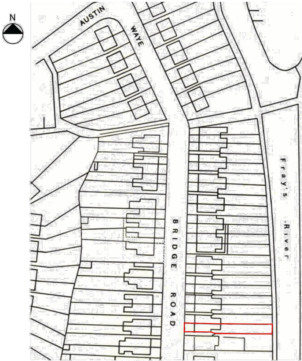
01 - OS MAP