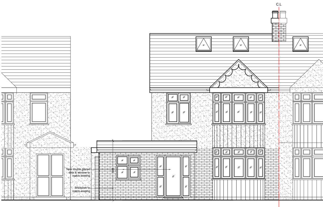
01 - FRONT ELEVATION