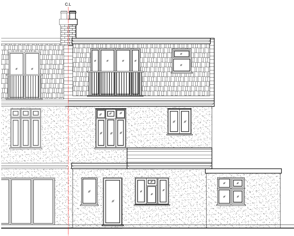
02 - REAR ELEVATION