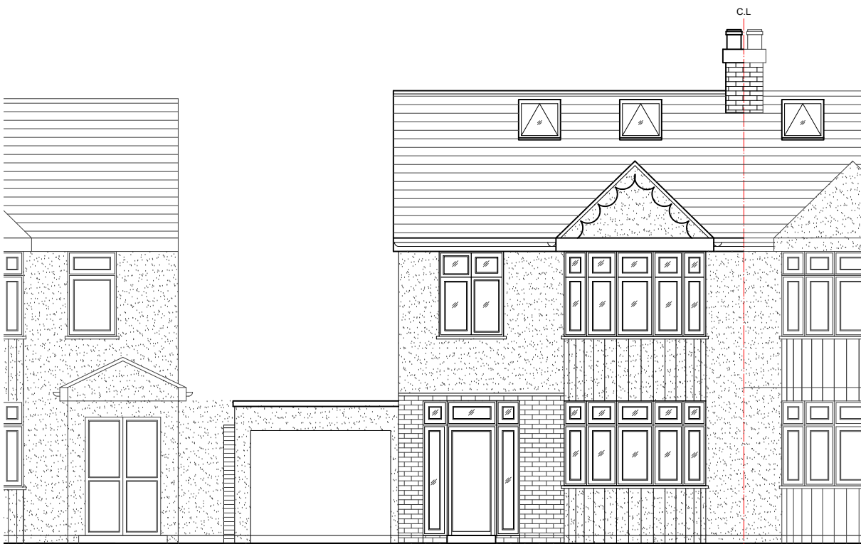
01 - FRONT ELEVATION