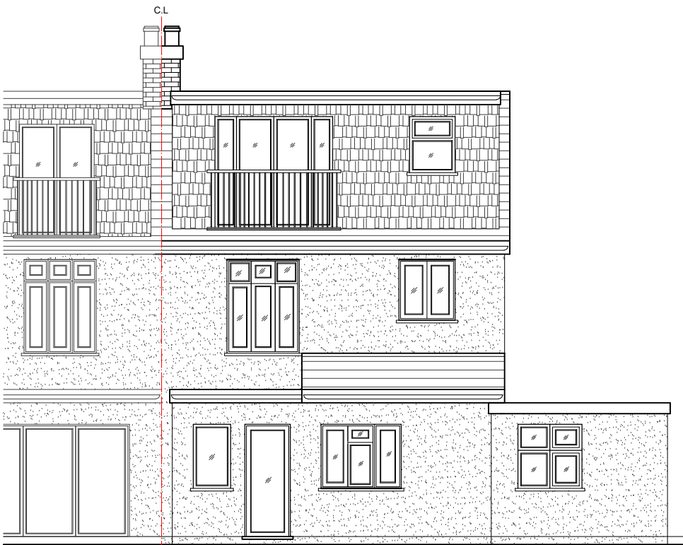
02 - REAR ELEVATION