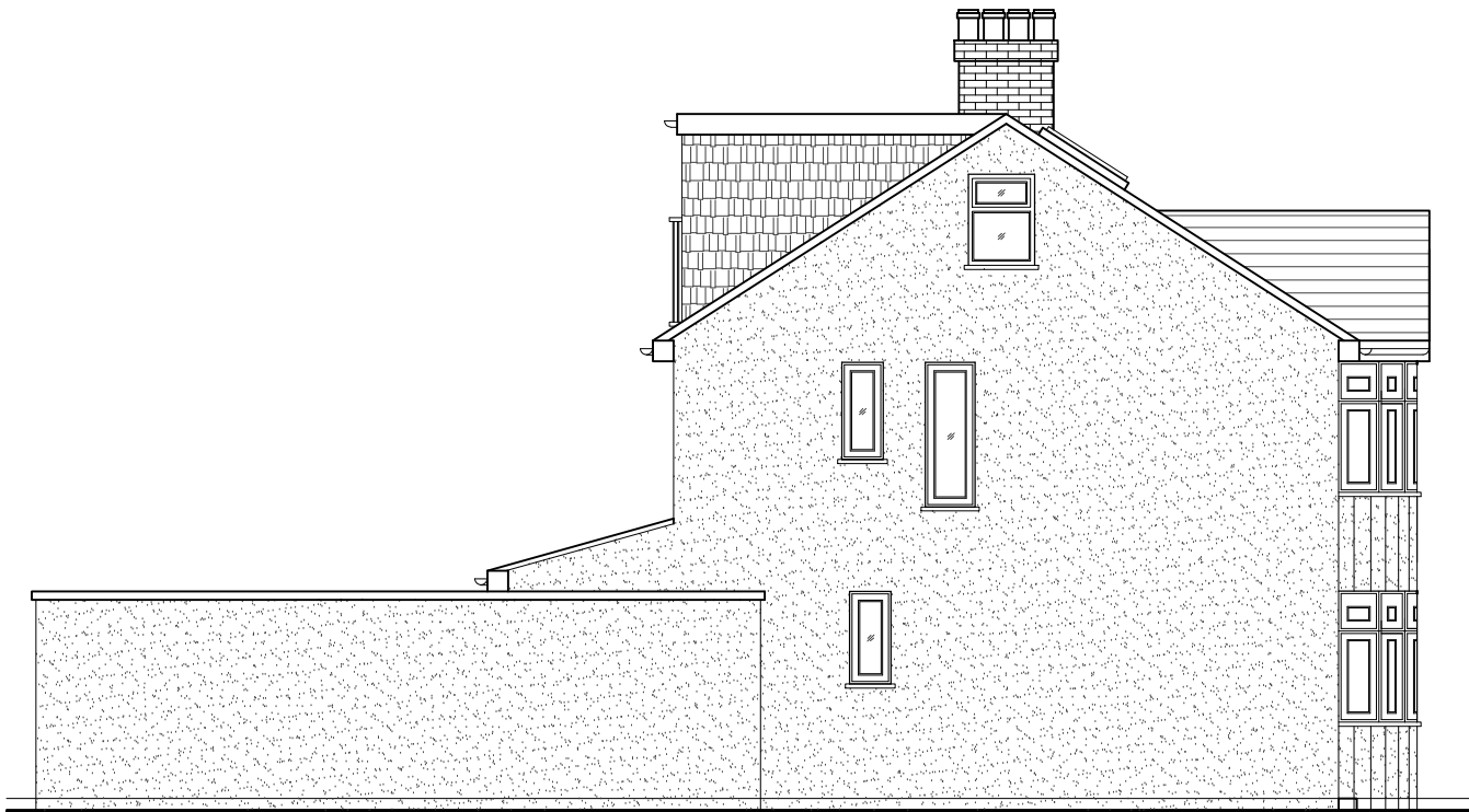
03 - SIDE ELEVATION