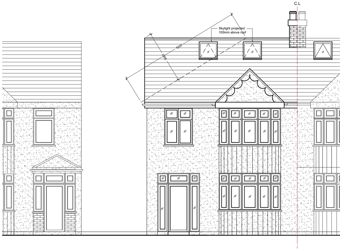
01 - FRONT ELEVATION