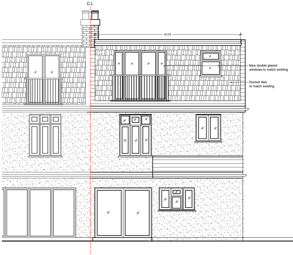
02 - REAR ELEVATION