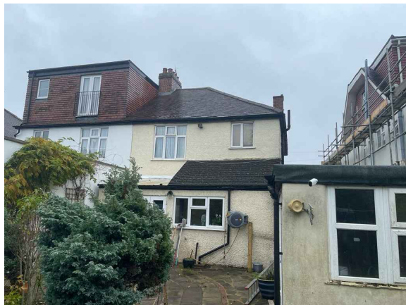
EXISTING REAR IMAGE