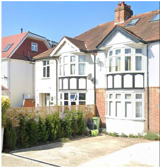
EXISTING FRONT IMAGE