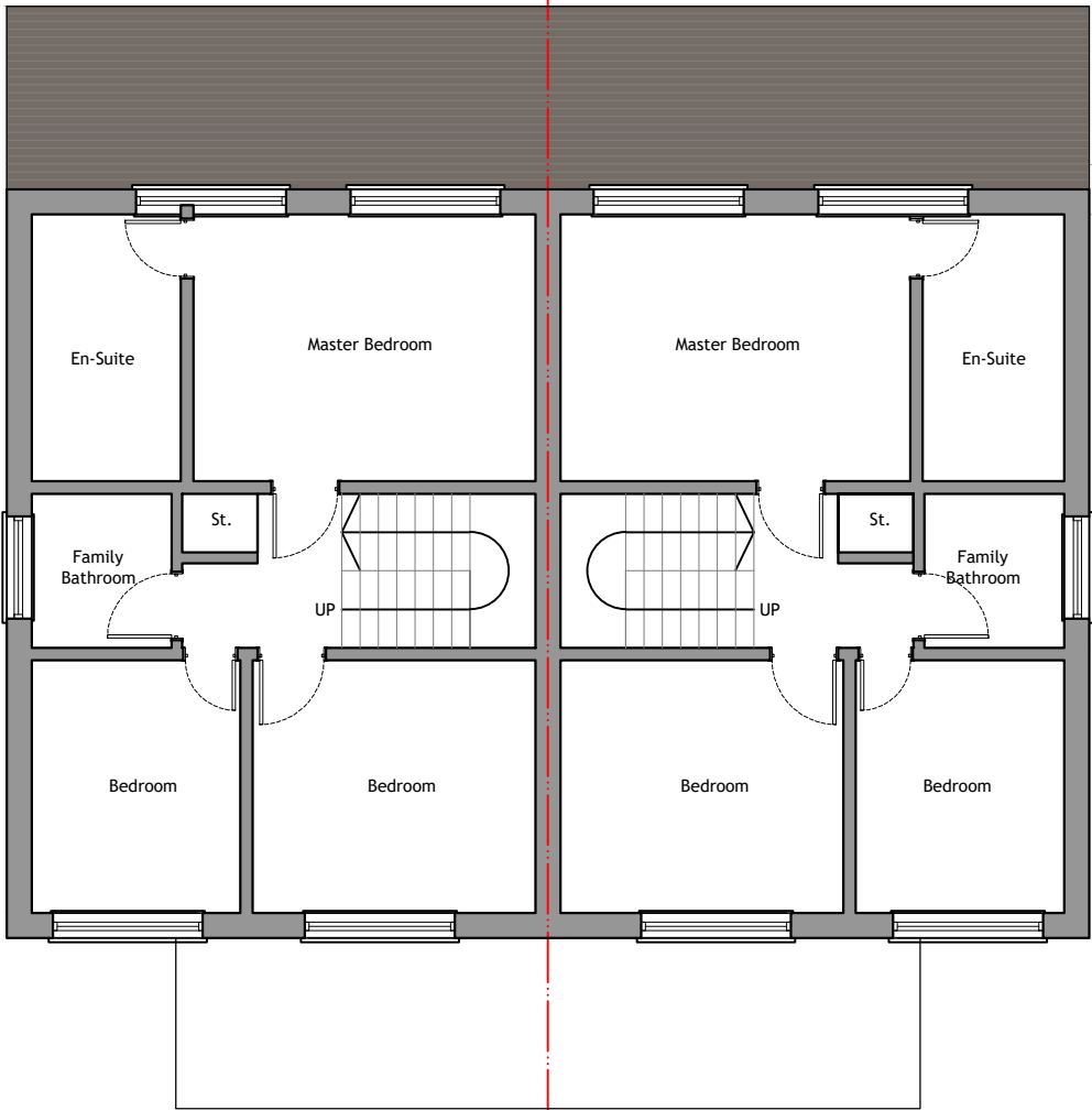
Existing First Floor Plan Scale 1:100