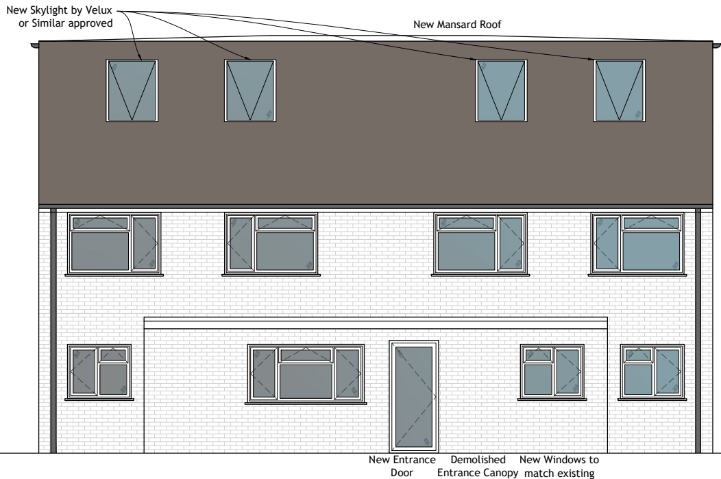
Proposed Front Elevation Scale 1:100

Ridge Height +7.99m Ceiling +7.51m Second Floor +5.11m Ceiling +4.86m First Floor +2.50m Ceiling +2.30m Ground Floor +0.00m