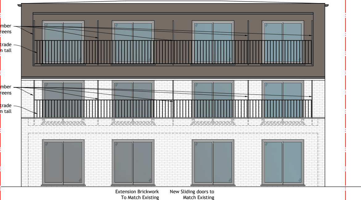
Proposed Rear Elevation Scale 1:100

Ridge Height +7.99m Ceiling +7.51m Second Floor +5.11m Ceiling +4.86m First Floor +2.50m Ceiling +2.30m Ground Floor +0.00m