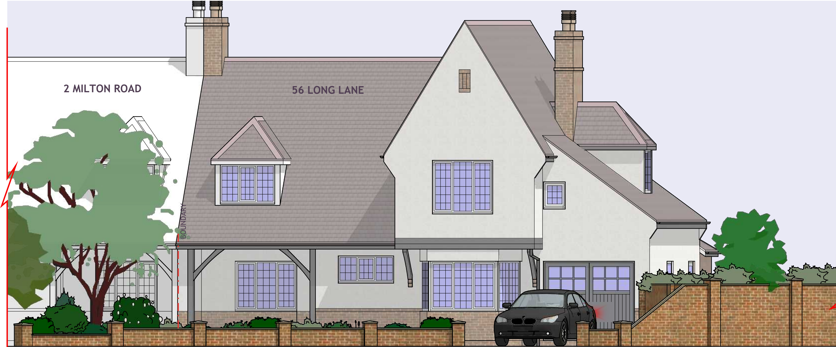
Existing front or road facing Elevation 1 : 5 0