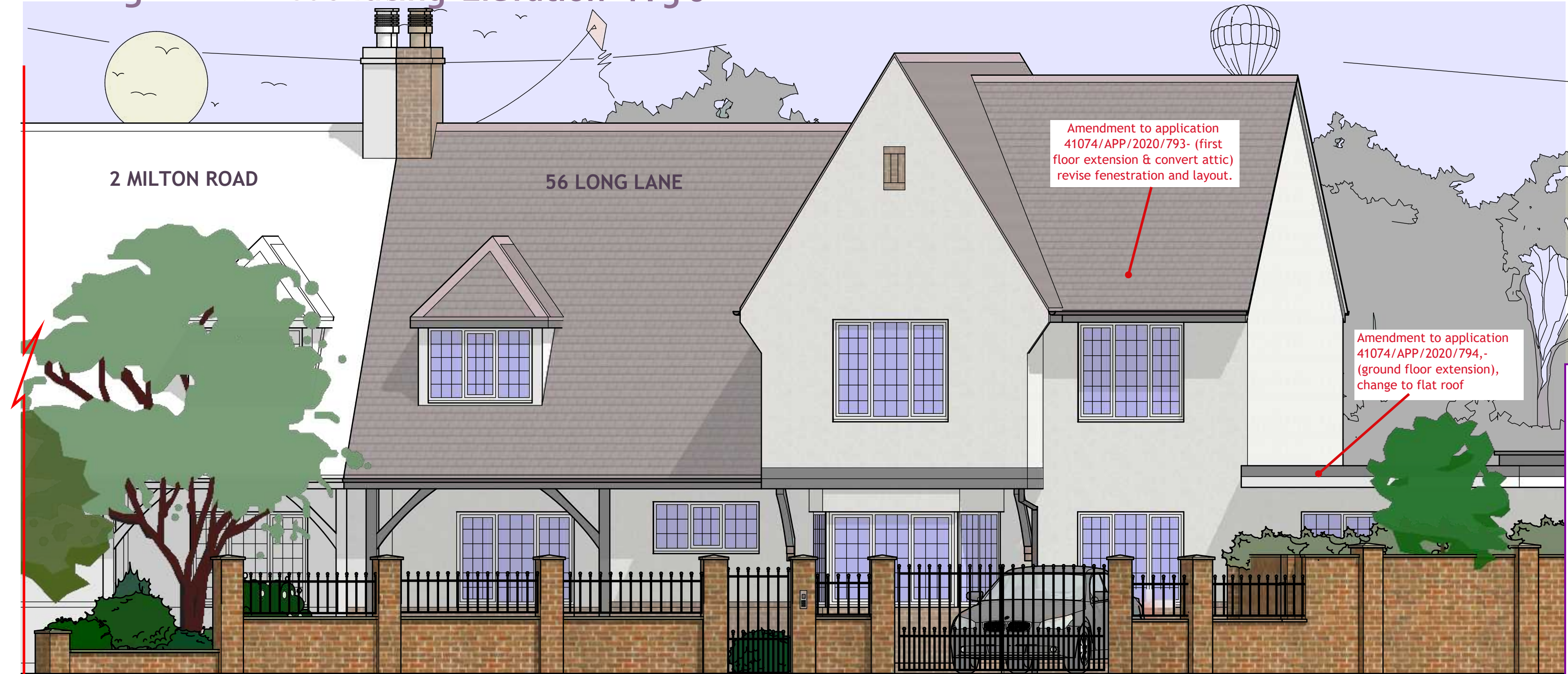
Proposed front or road facing Elevation 1 : 5 0

Extant permission (work commenced) for application 41074/APP/2020/793,- first floor extension and attic conversion Extant permission (work commenced) for application 41074/APP/2020/794,- ground floor extension