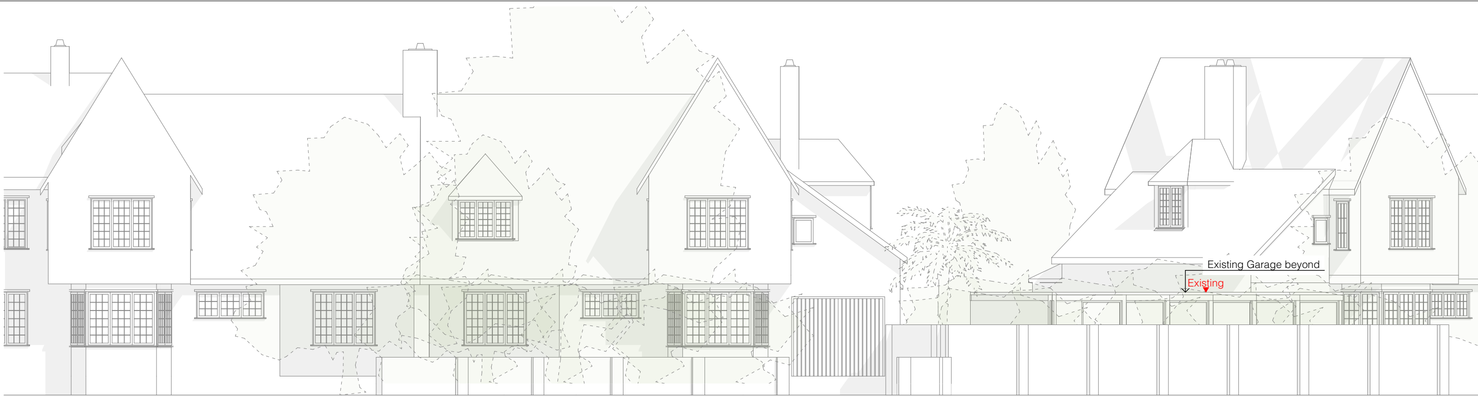
SE 56 Long Lane Existing Street Elevation 54 Long Lane 1:100