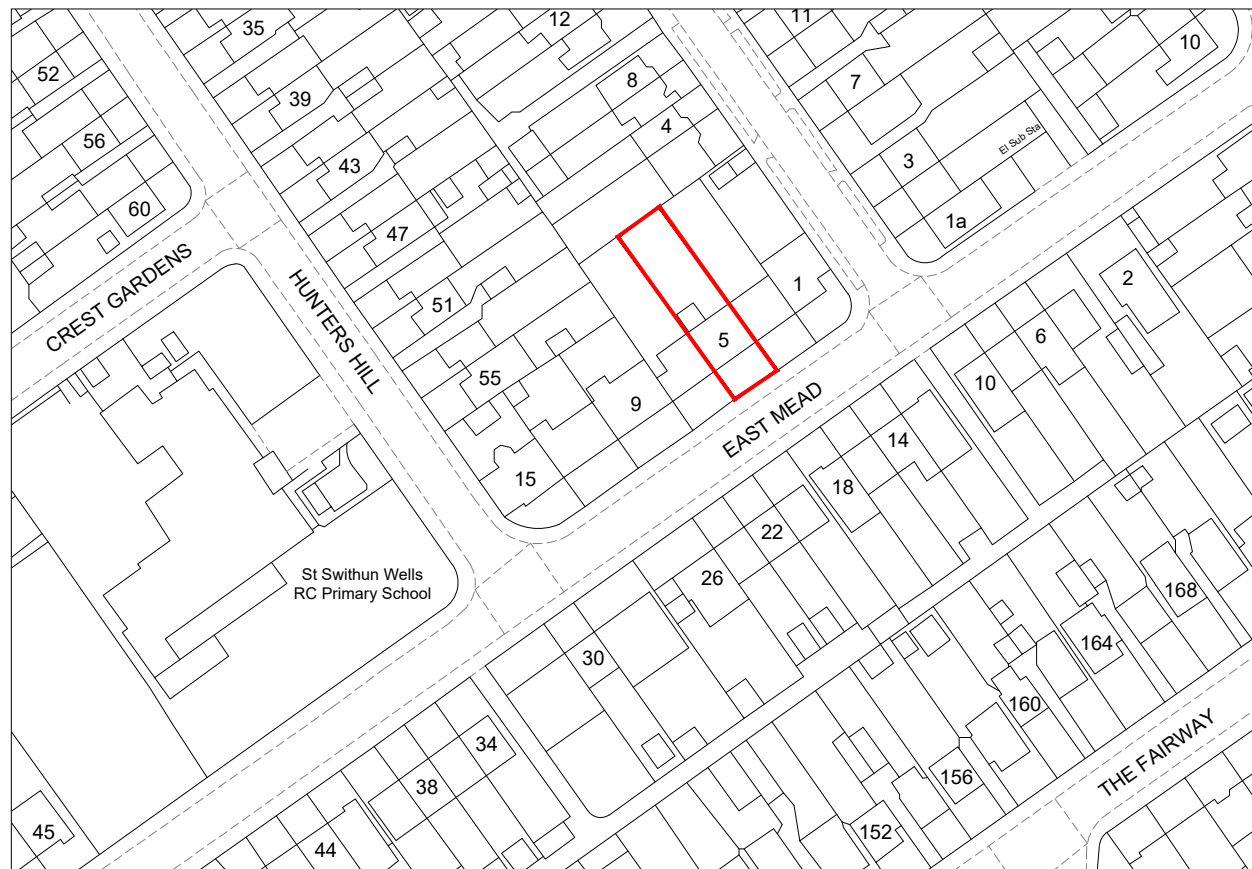
LOCATION PLAN Scale: 1/1250