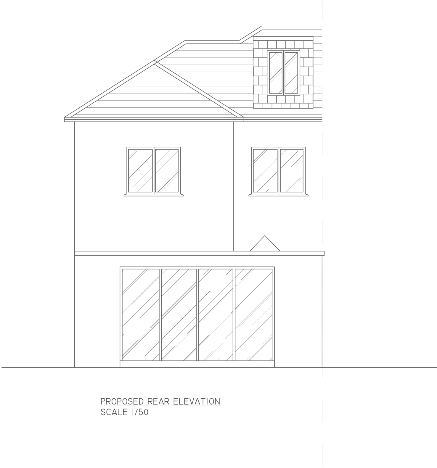
PROPOSED REAR ELEVATION SCALE 1/50