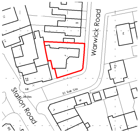
1 Red Line Plan 1:1250