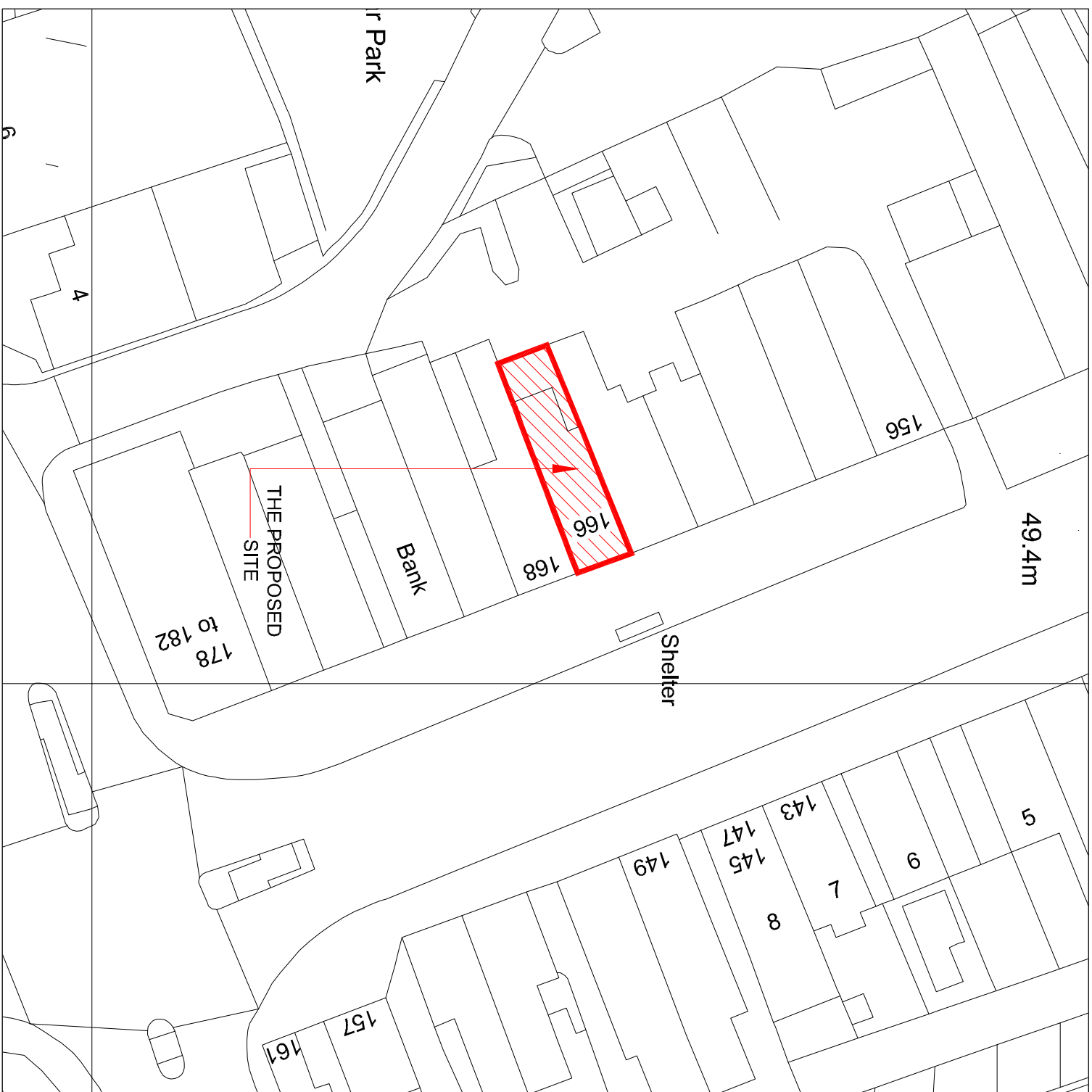
LOCATION PLAN SCALE 1:500 @ A3