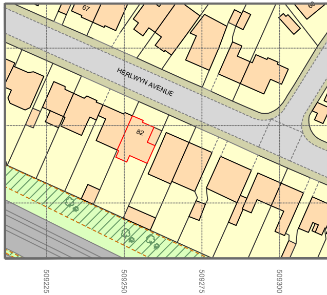
Site plan (1:1250)