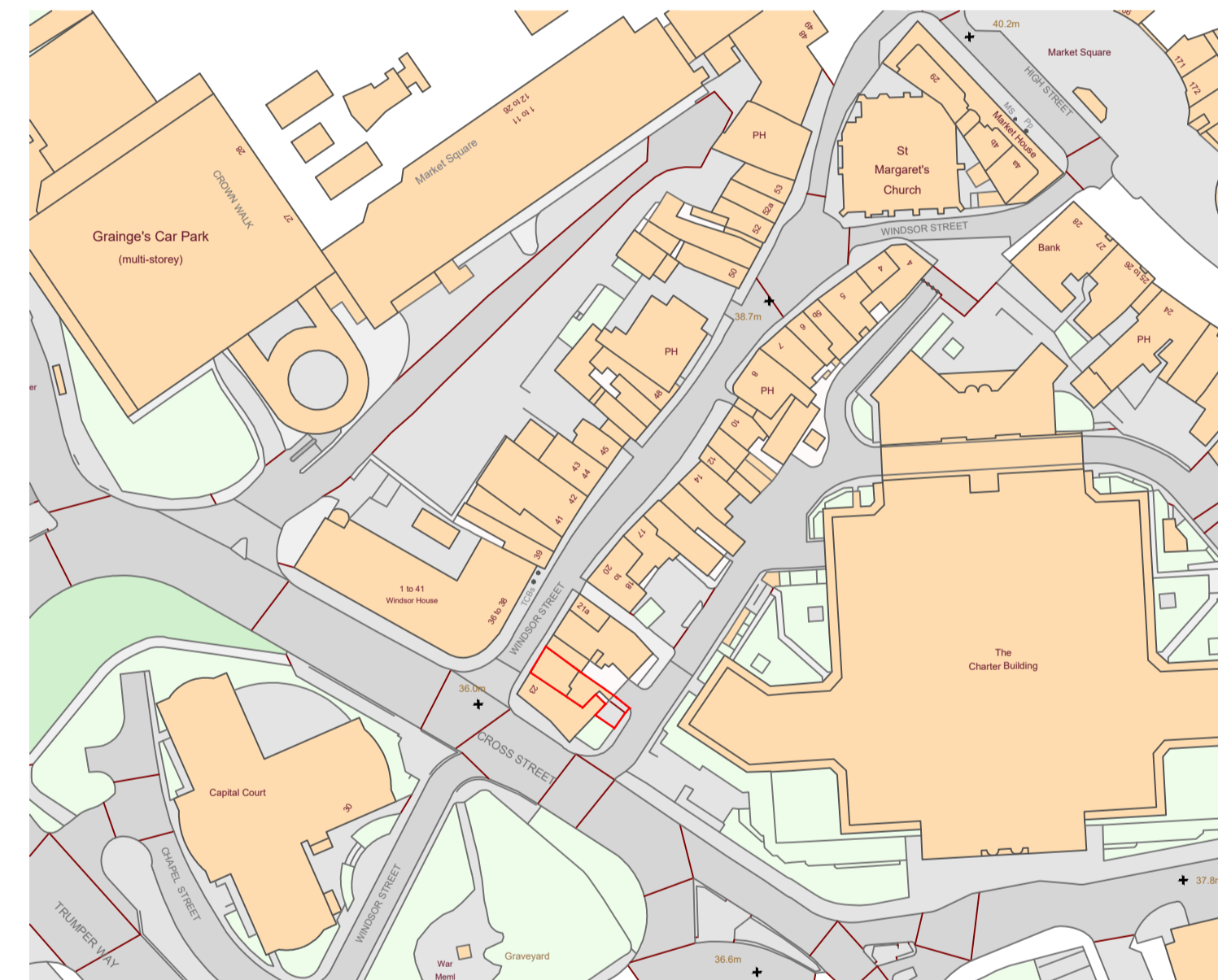
LOCATION PLAN SCALE 1:1250 20 0 20 40 60 80 100Metres