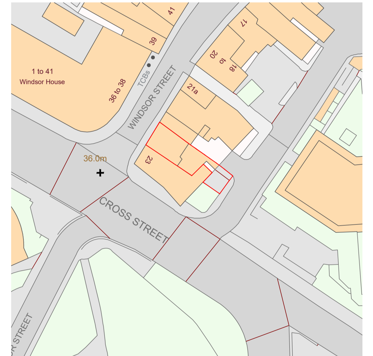
BLOCK PLAN SCALE 1:500 5 0 5 10 20 40Metres

THIS DRAWING HAS BEEN PRODUCED FROM EMAPSITE ORDINANCE SURVEY MASTER MAP Reproduction in whole or in part is prohibited without the prior permission of Ordnance Survey.