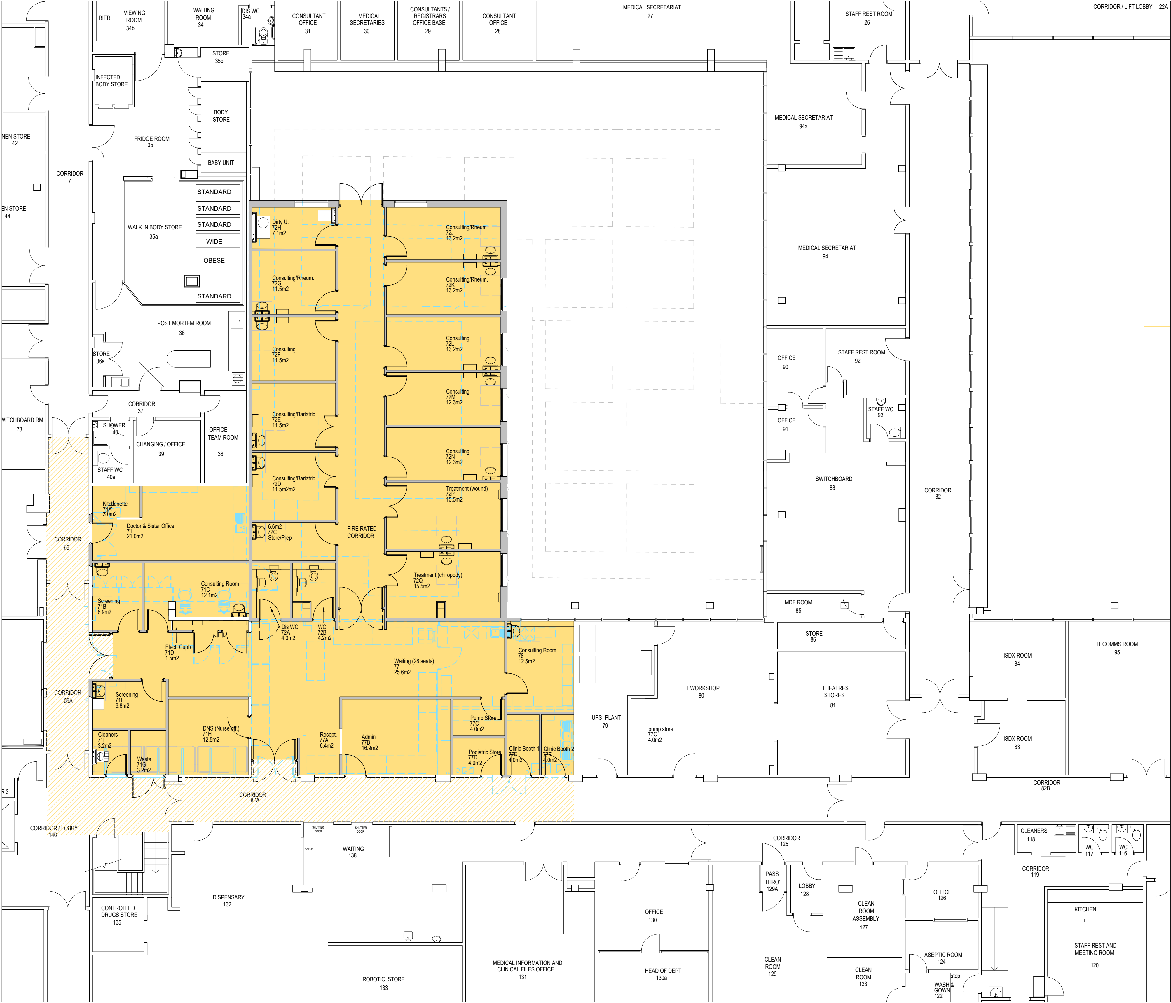
01 Phase 4, THH,Block 27, Lower Ground Floor, Diabetics - Proposed Location, Proposed Plan (01)014 1:100 @ A1