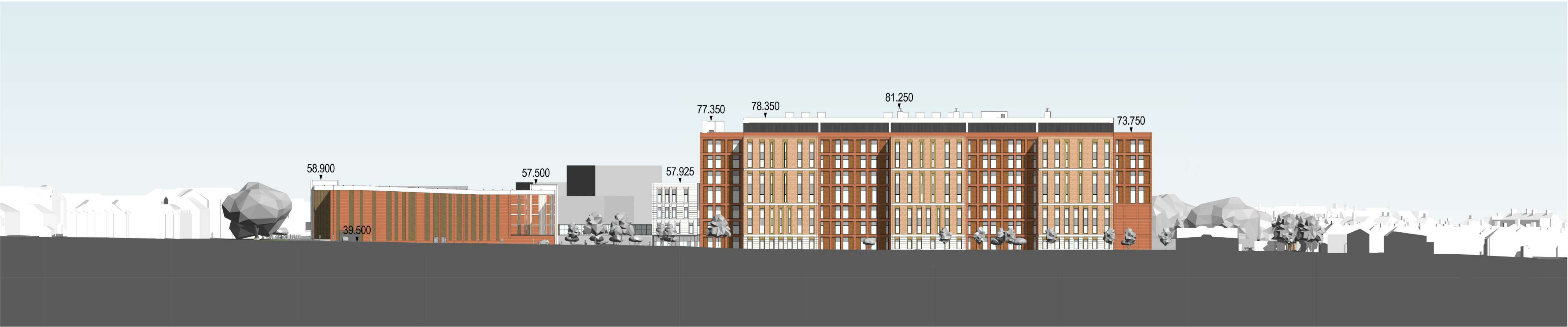
Streetscene Elevation West 1 : 500