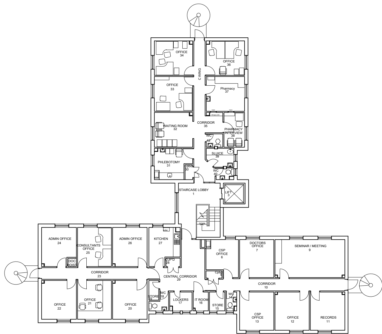
TUDOR CENTRE FIRST FLOOR PLAN GROSS INT AREA = 317.5 m sq