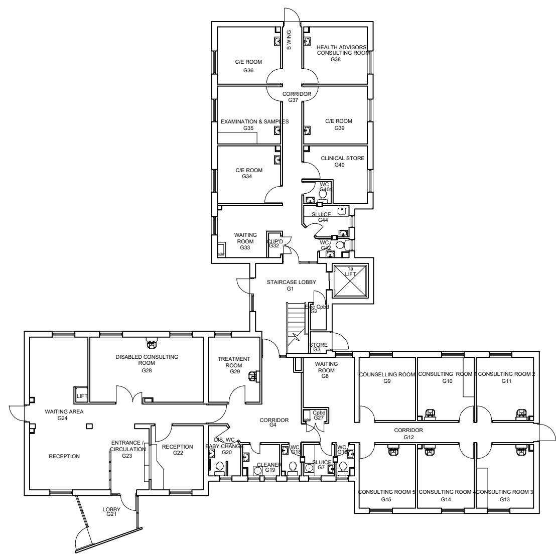
TUDOR CENTRE GROUND FLOOR PLAN GROSS INT AREA = 323.8 m sq