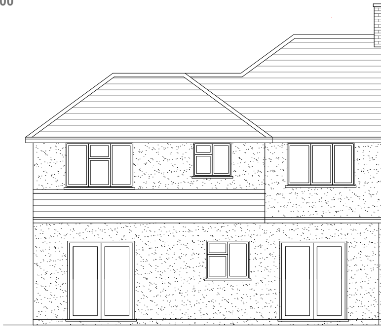
Existing Rear Elevation Scale 1:100