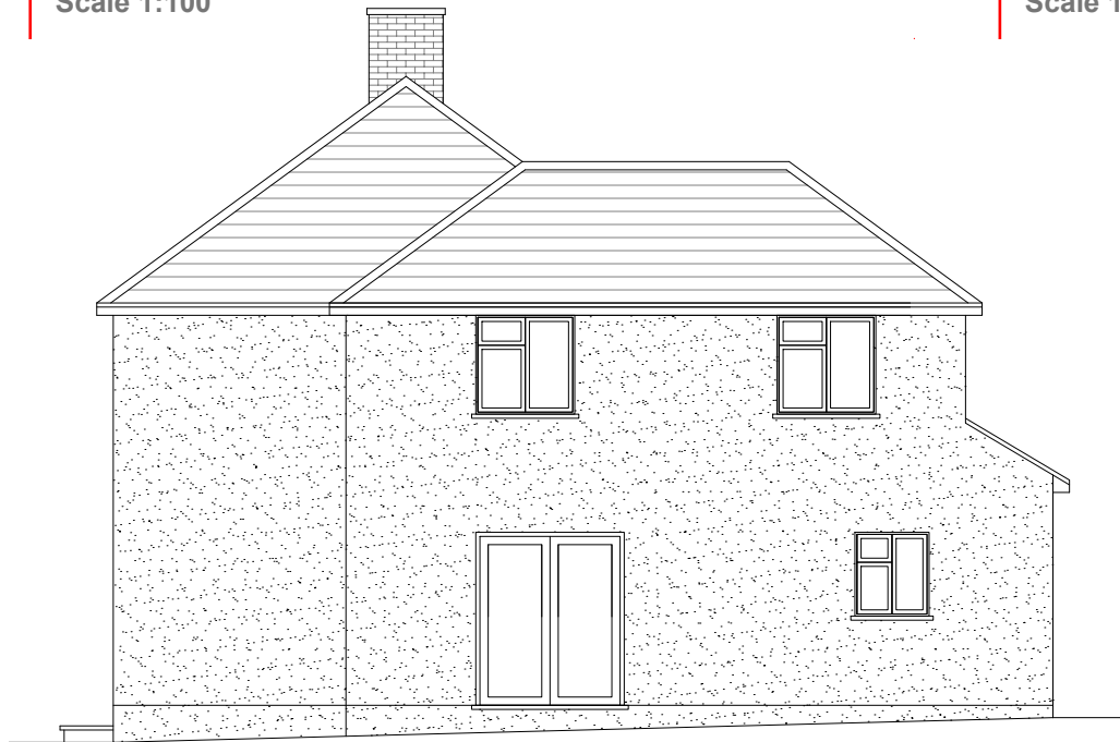
Proposed Side Elevation Scale 1:100