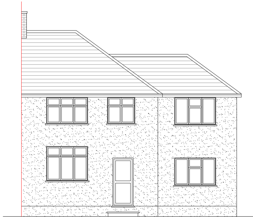
Existing Front Elevation Scale 1:100