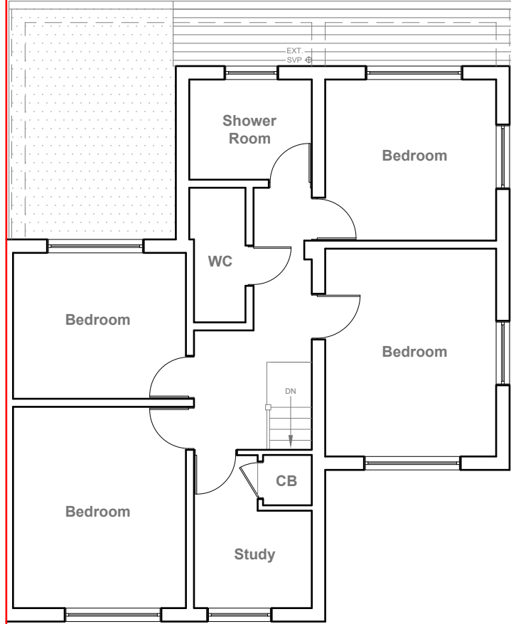
Existing First Floor Plan Scale 1:100