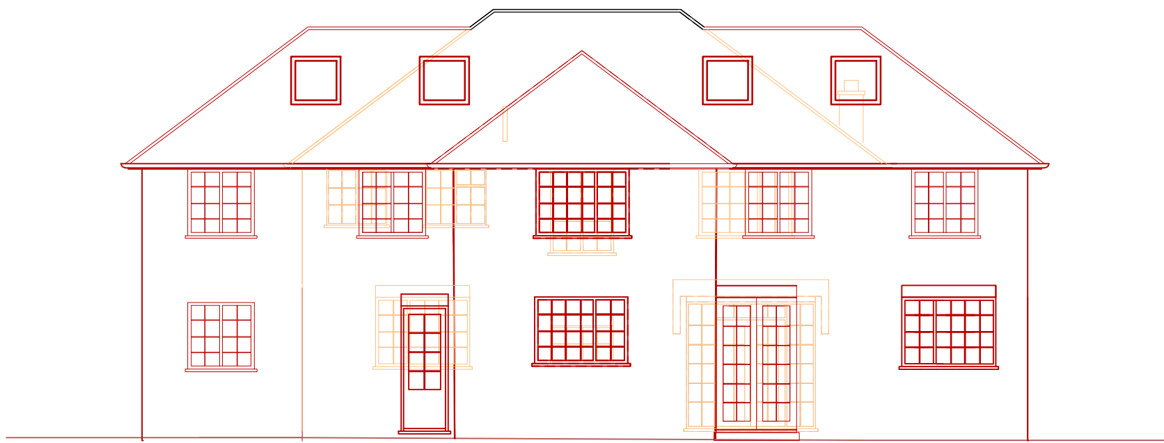
PROPOSED WEST REAR ELEVATION DATUM 100.00