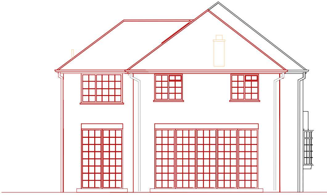
PROPOSED S. FLANK ELEVATION DATUM 100.00