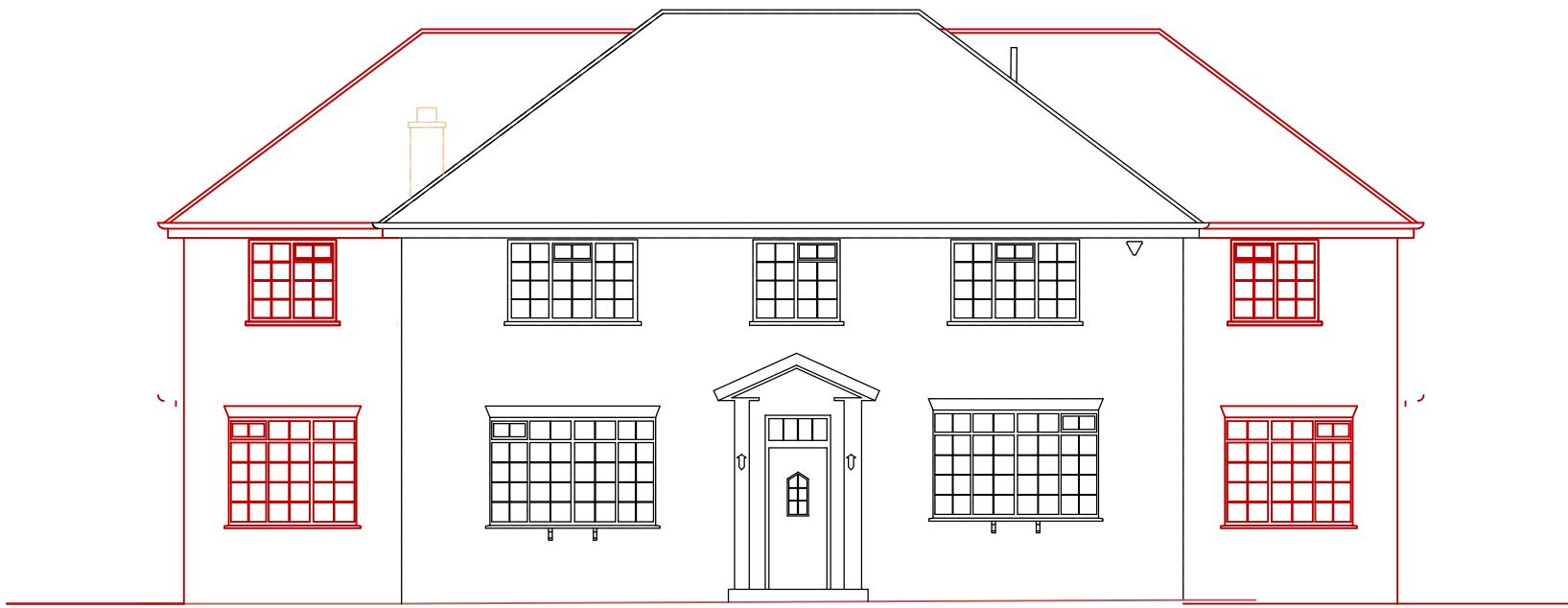
PROPOSED EAST FRONT ELEVATION DATUM 100.00