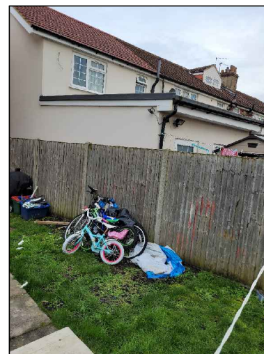
A VIEW REAR EXTENSION OF HOUSE NUMBER 88A