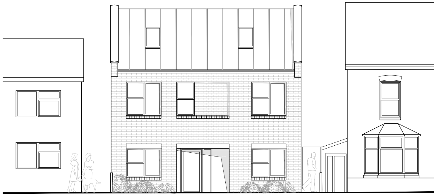
1 / Front Elevation