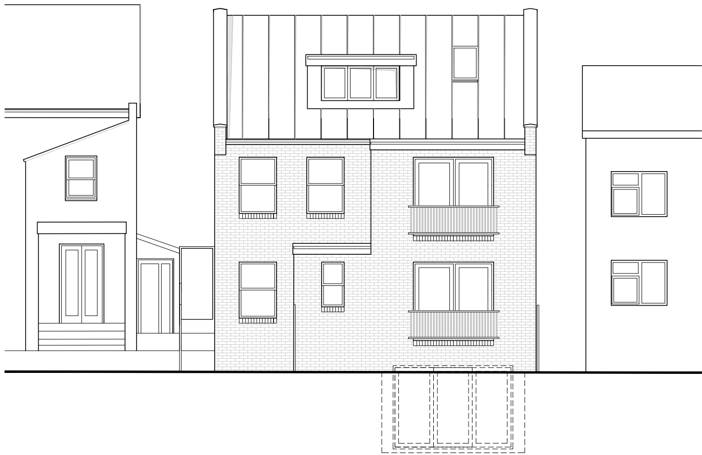
1 / Front Elevation