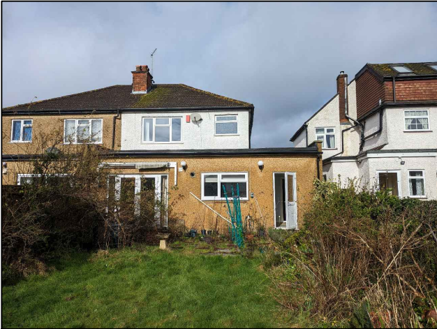
No.60 No.58 No.56