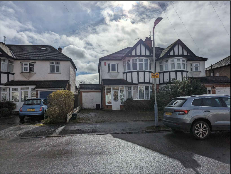
No.56 No.58 No.60