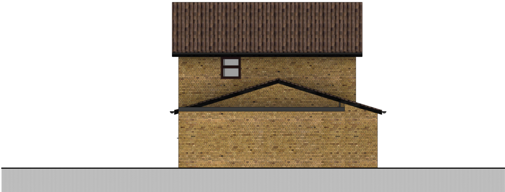
02 02 PROP ELEV SIDE Scale: 1:100