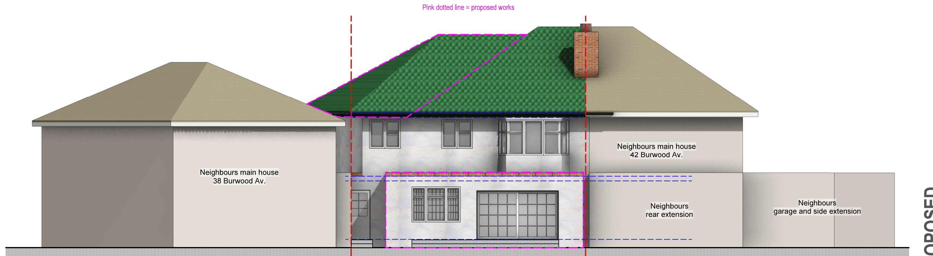
02 02 PROP ELEV REAR Scale: 1:100