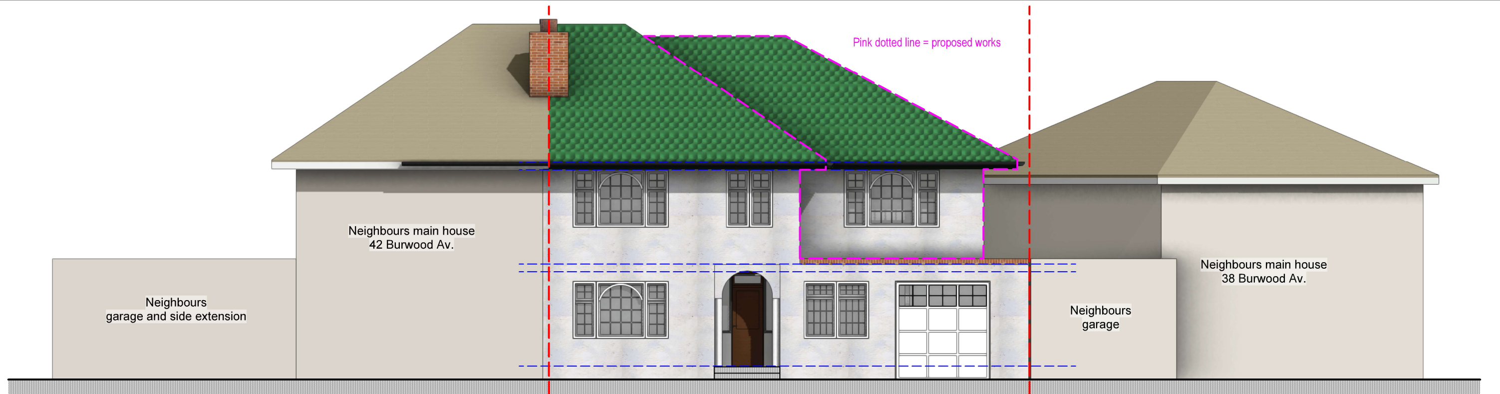
01 01 PROP ELEV FRONT Scale: 1:100