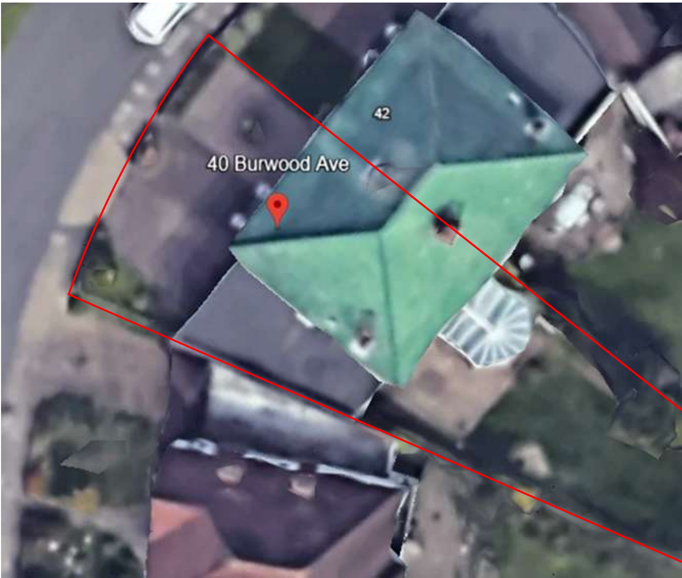
AERIAL VIEW Site shown in red

Description of proposed works Demolition of existing rear conservatory. Single storey rear extension with internal alterations and rooflights. Double storey side extension.