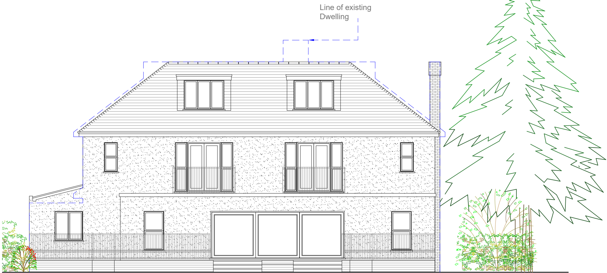
Proposed Rear Elevation Scale 1:100