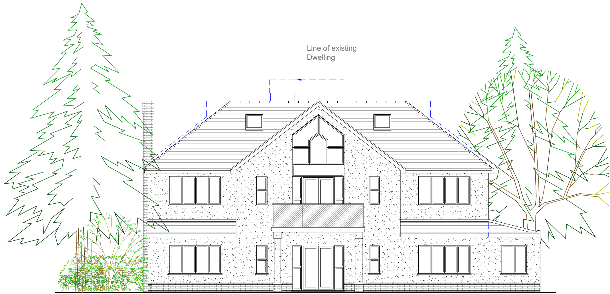
Proposed Front Elevation Scale 1:100