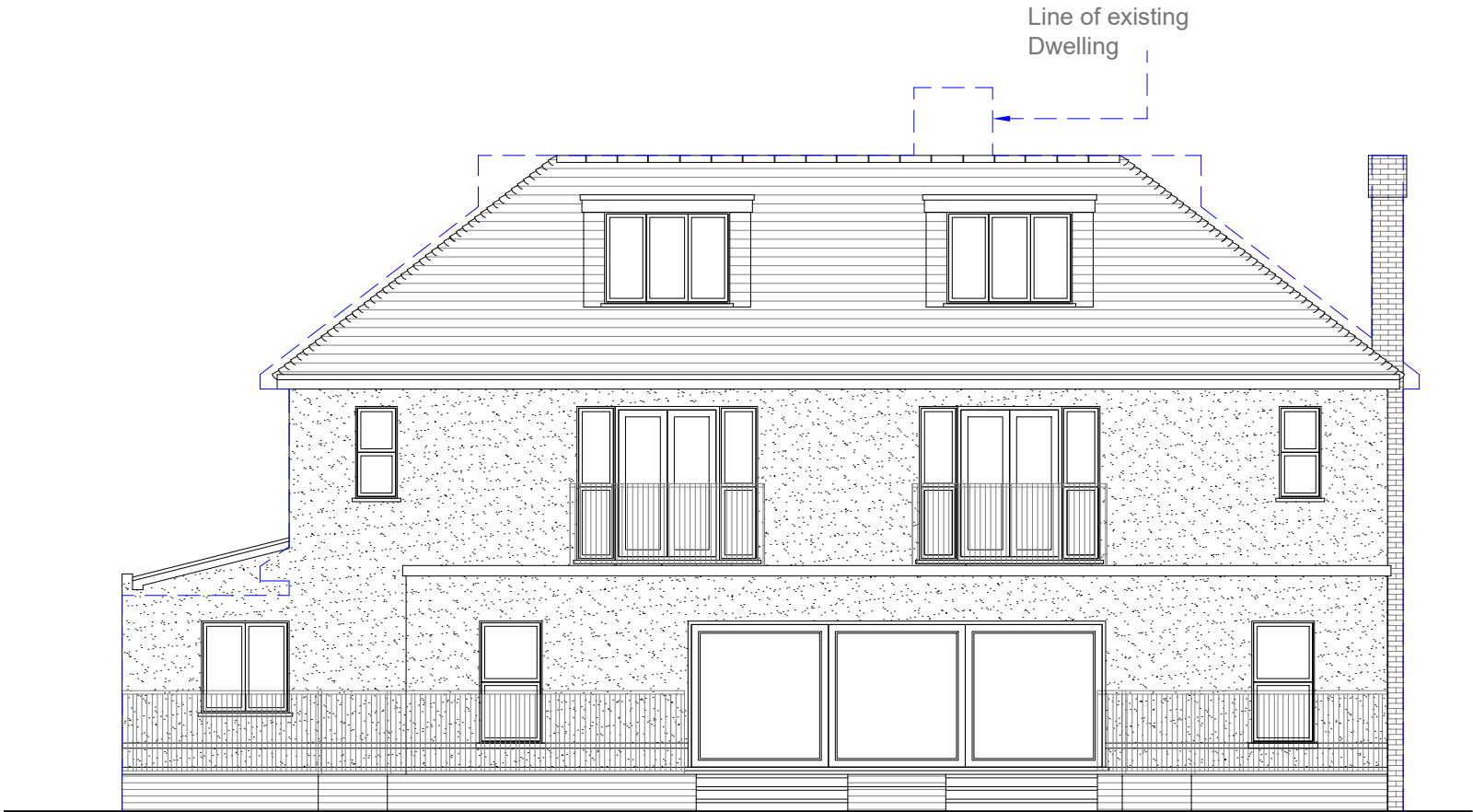
Proposed Rear Elevation Scale 1:100