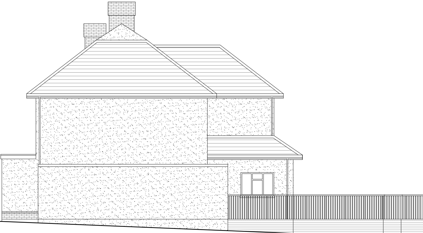
Existing Side Elevation Scale 1:100