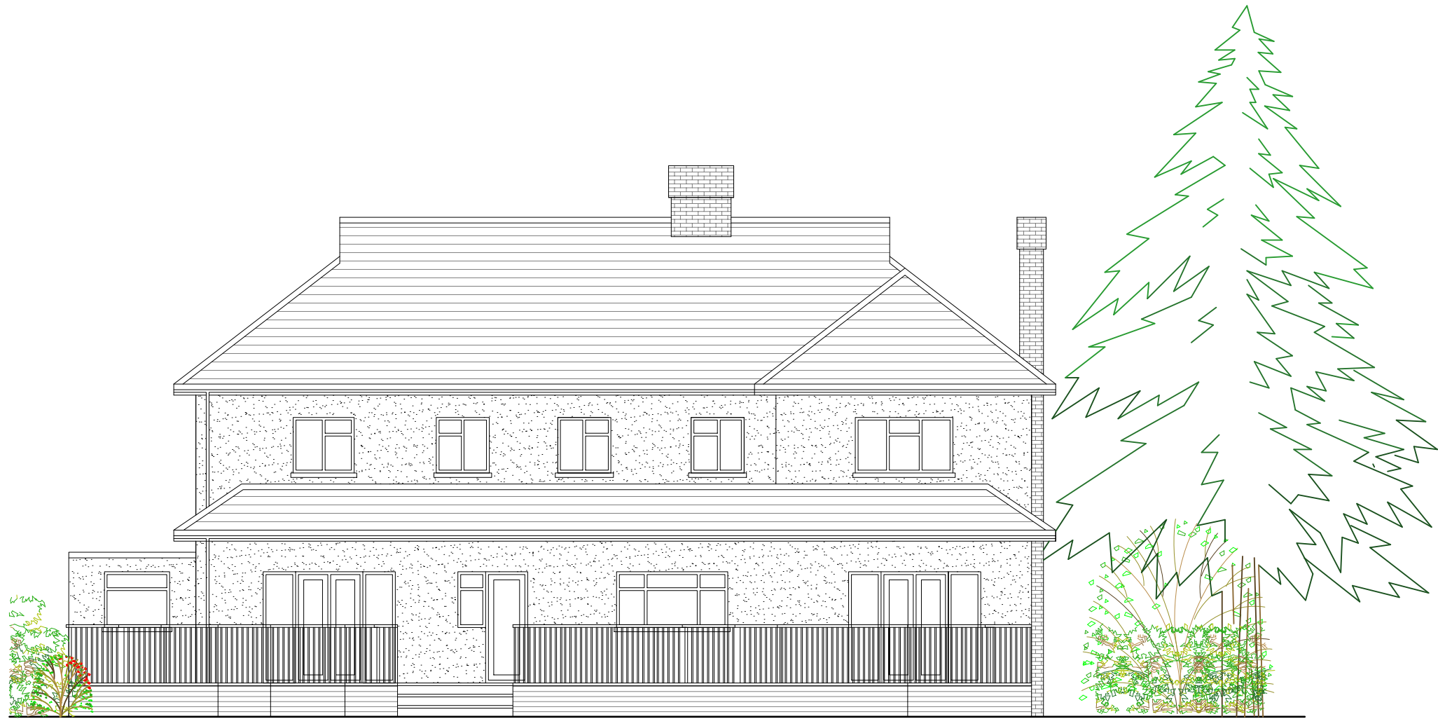
Existing Rear Elevation Scale 1:100