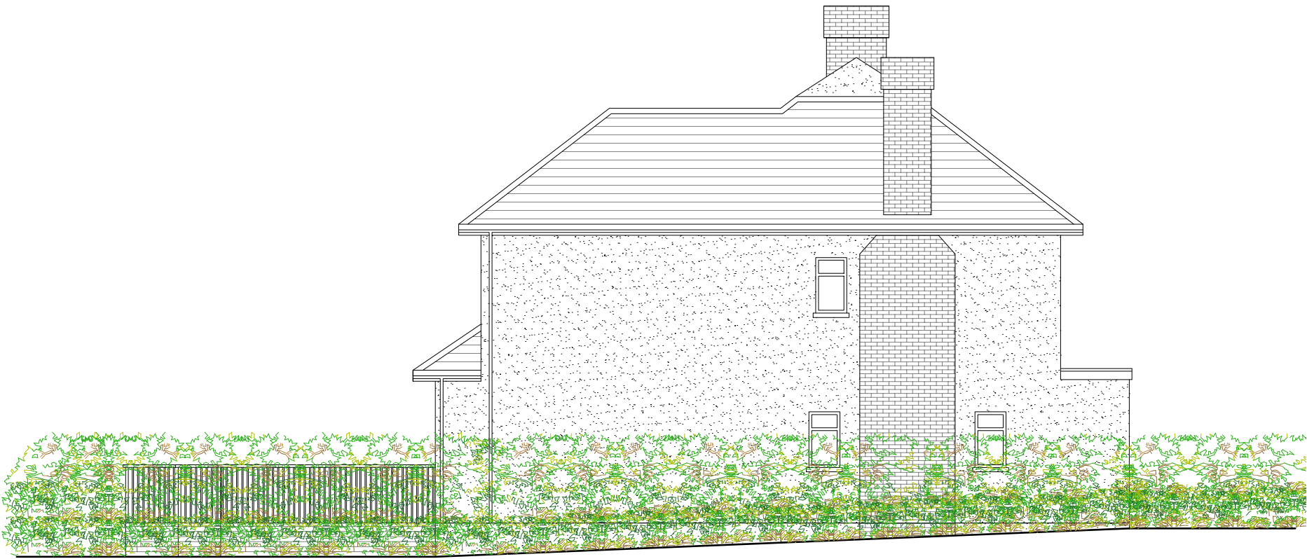
Existing Side Elevation Scale 1:100