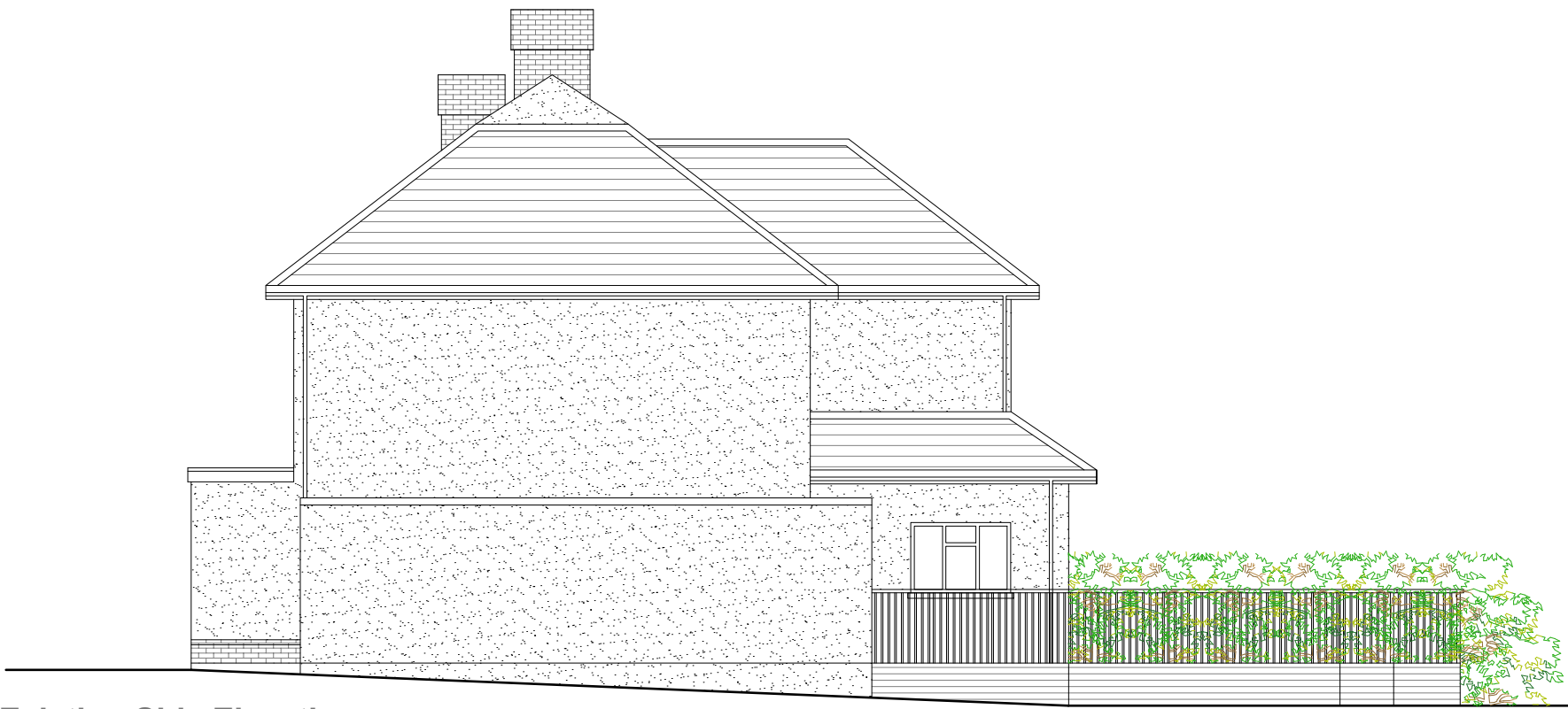
Existing Side Elevation Scale 1:100