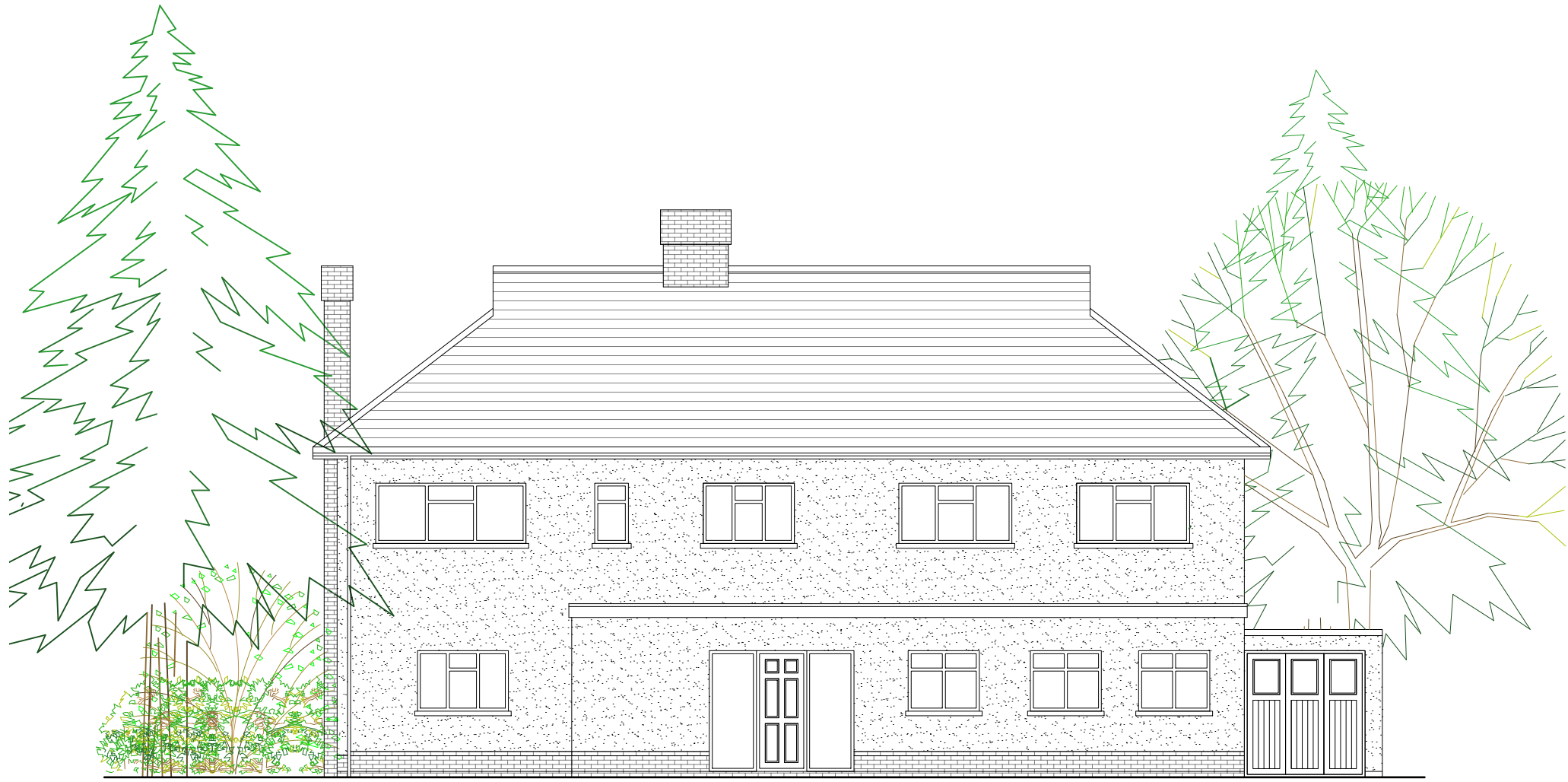
Existing Front Elevation Scale 1:100