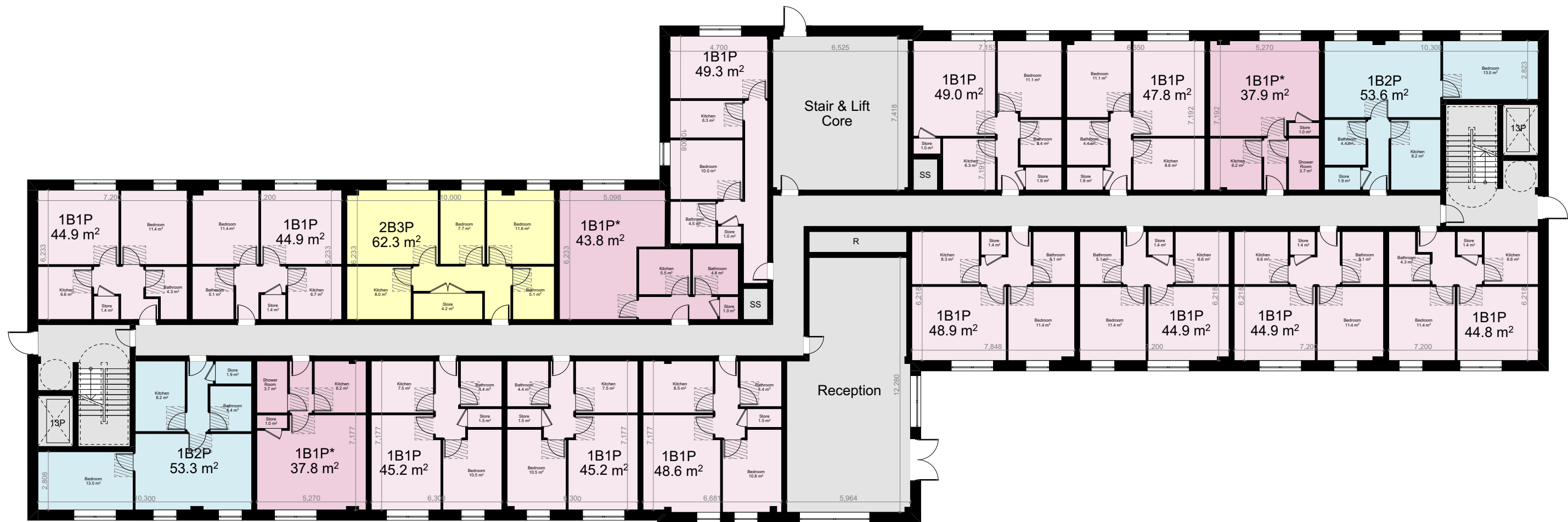
Accommodation Schedule - Class MA