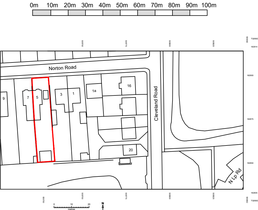
Location Plan 1 : 1 2 5 0