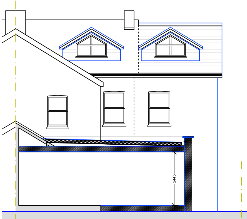
○ Section B - B 1:100