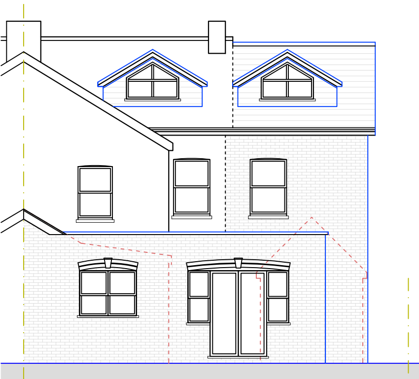
○ Rear Elevation 1:100