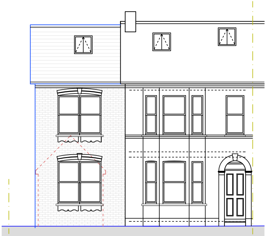
○ Front Elevation 1:100

NOTES GENERAL: GENERAL: • Work to figured dimensions and relative position only, confirm to designer • This drawing is to be read in conjunction with all relevant drawings, detailed specifications where applicable and all associated drawings in this series (if any) • Any discrepancy on this drawing is to be reported immediately to Oakman Architecture Ltd for clarification • The contractor is responsible for all temporary works and for the stability of the works in progress