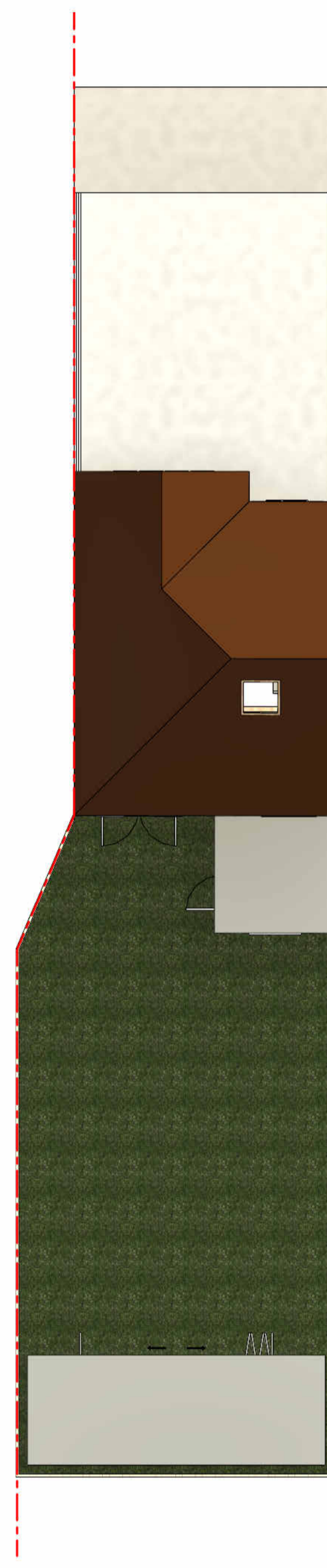
Roof Floor- Existing 1 : 100