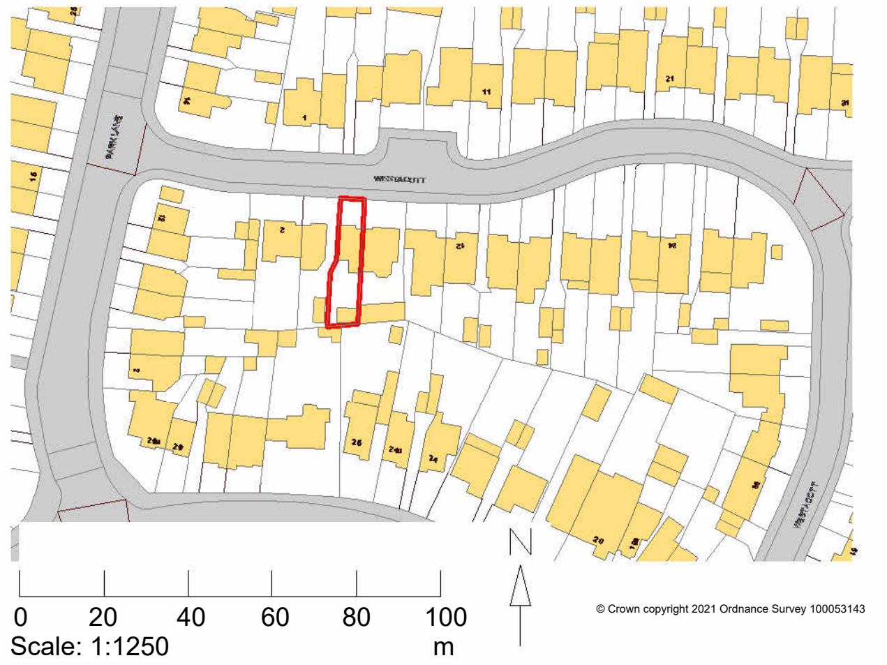
Site Plan, 1:1250