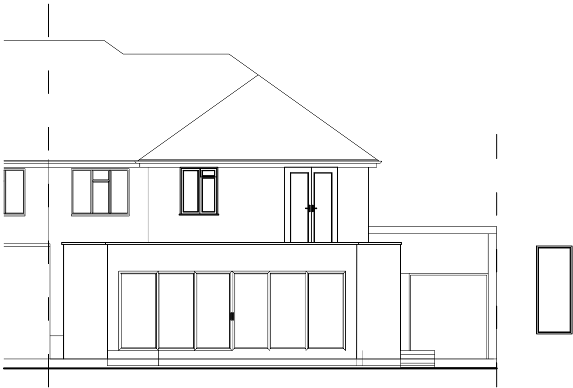
3 As Built Rear Elevation