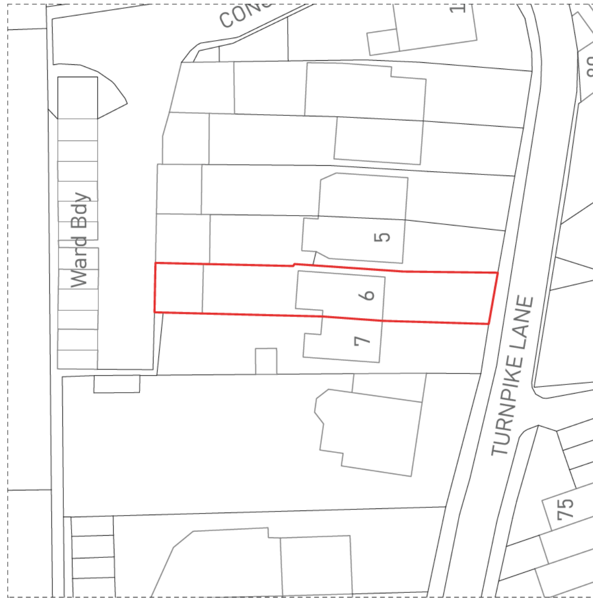
1 Block Plan Scale: 1:500

Drawings based on survey information provided by others. Use figured dimensions only. Verify all dimensions on site. Drawing should be read in conjunction with information from all other design consultants and contractors. All drawings in digital format are for reference only, paper copies are available on request. Copyright to these drawings and the designs shown therein are retained by Bluebead Architects Ltd.