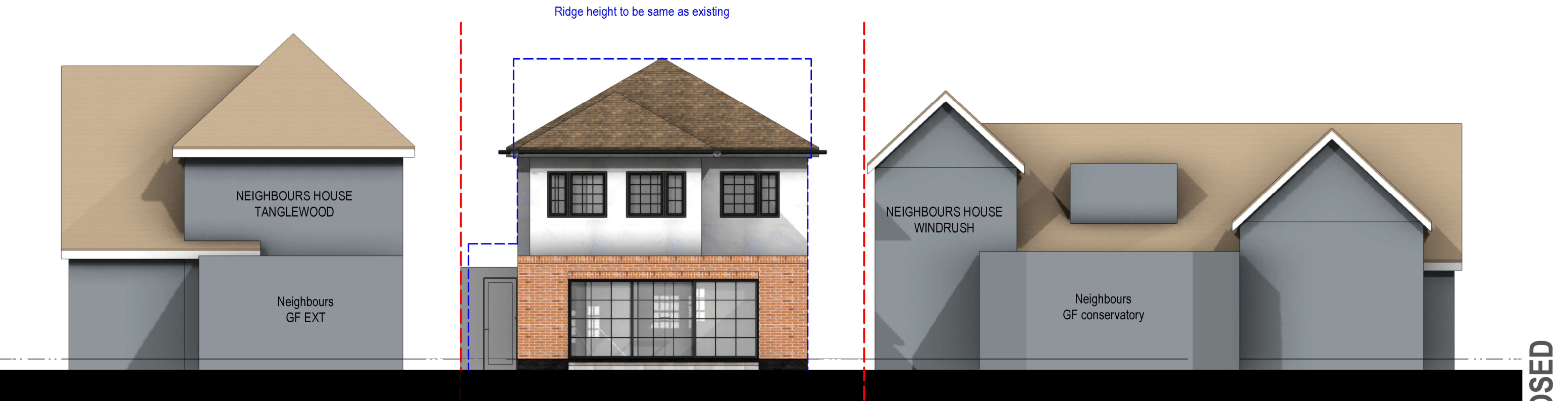
2 02 PROP ELEV REAR Scale: 1:100