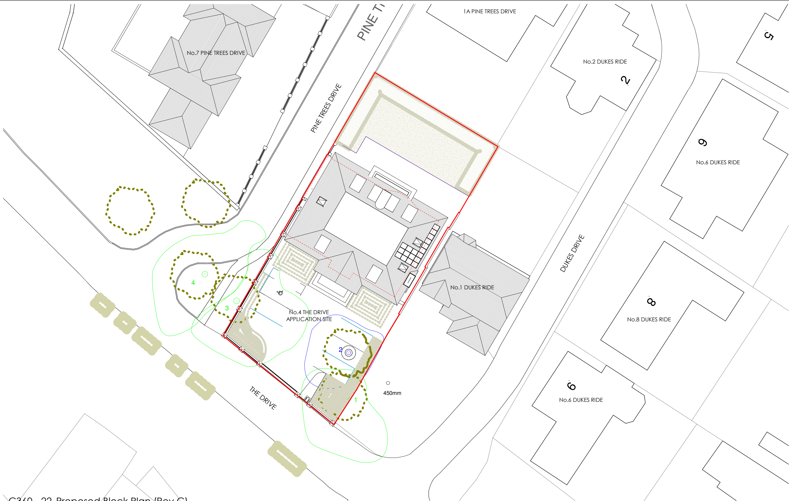
C360 - 22 Proposed Block Plan (Rev C)

THE CONTRACTOR SHOULD CHECK ALL DIMENSIONS ON SITE. NO DIMENSIONS TO BE SCALED FROM THIS DRAWING (EXCEPT FOR PLANNING PURPOSES). NO PART OF THIS DRAWING IS TO BE COPIED OR REPRODUCED WITHOUT THE PRIOR CONSENT OF THE ARCHITECT. IT IS THE CONTRACTORS RESPONSIBILITY TO ENSURE COMPLIANCE WITH THE BUILDING REGULATIONS. ALL RIGHTS DESCRIBED IN CHAPTER IV OF THE COPYRIGHT, DESIGNS AND PATENTS ACT 1988 HAVE GENERALLY BEEN ASSERTED. ©