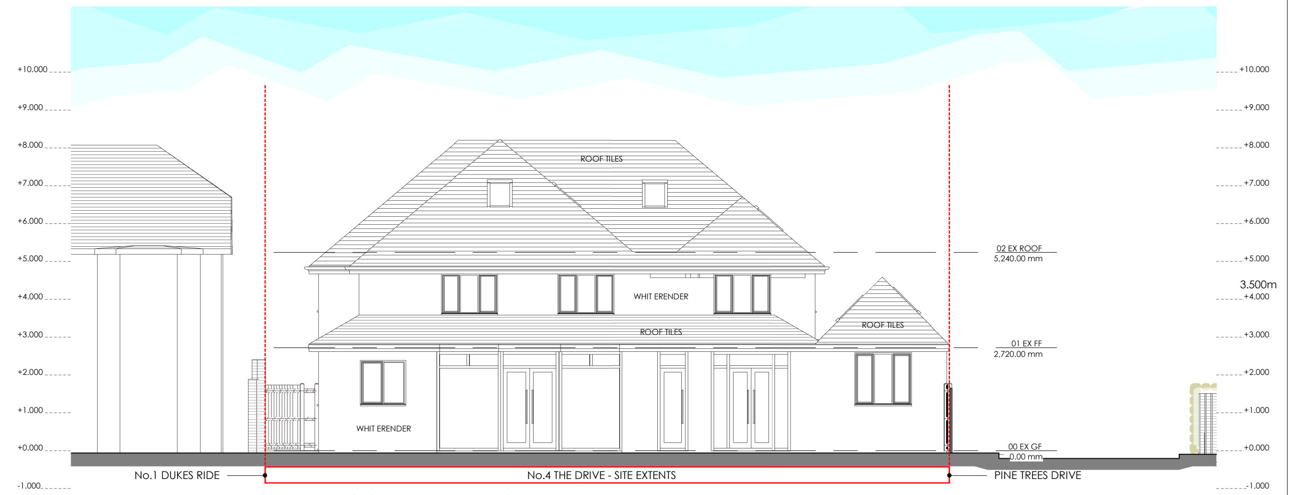
05.02 Existing Rear Elevation - Garden

C360 - 05 Existing Front & Rear Elevations (Rev C)