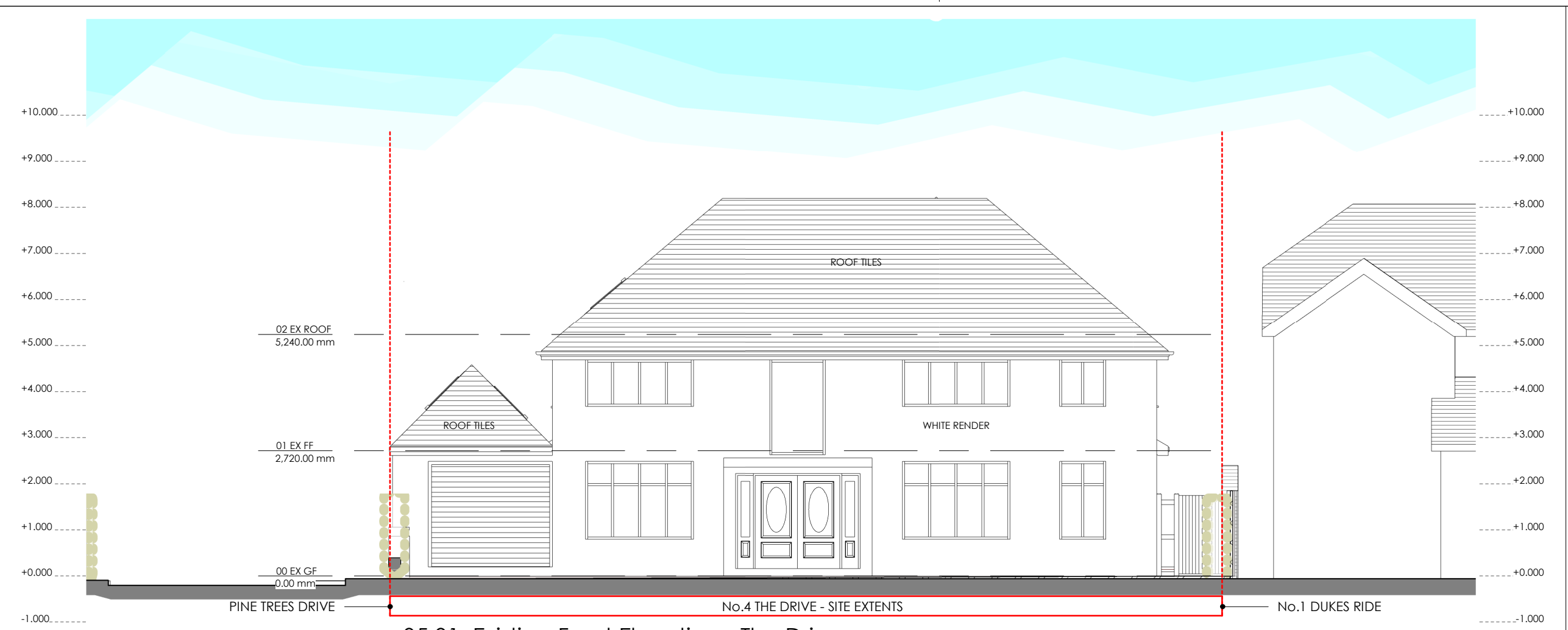
05.01 Existing Front Elevation - The Drive