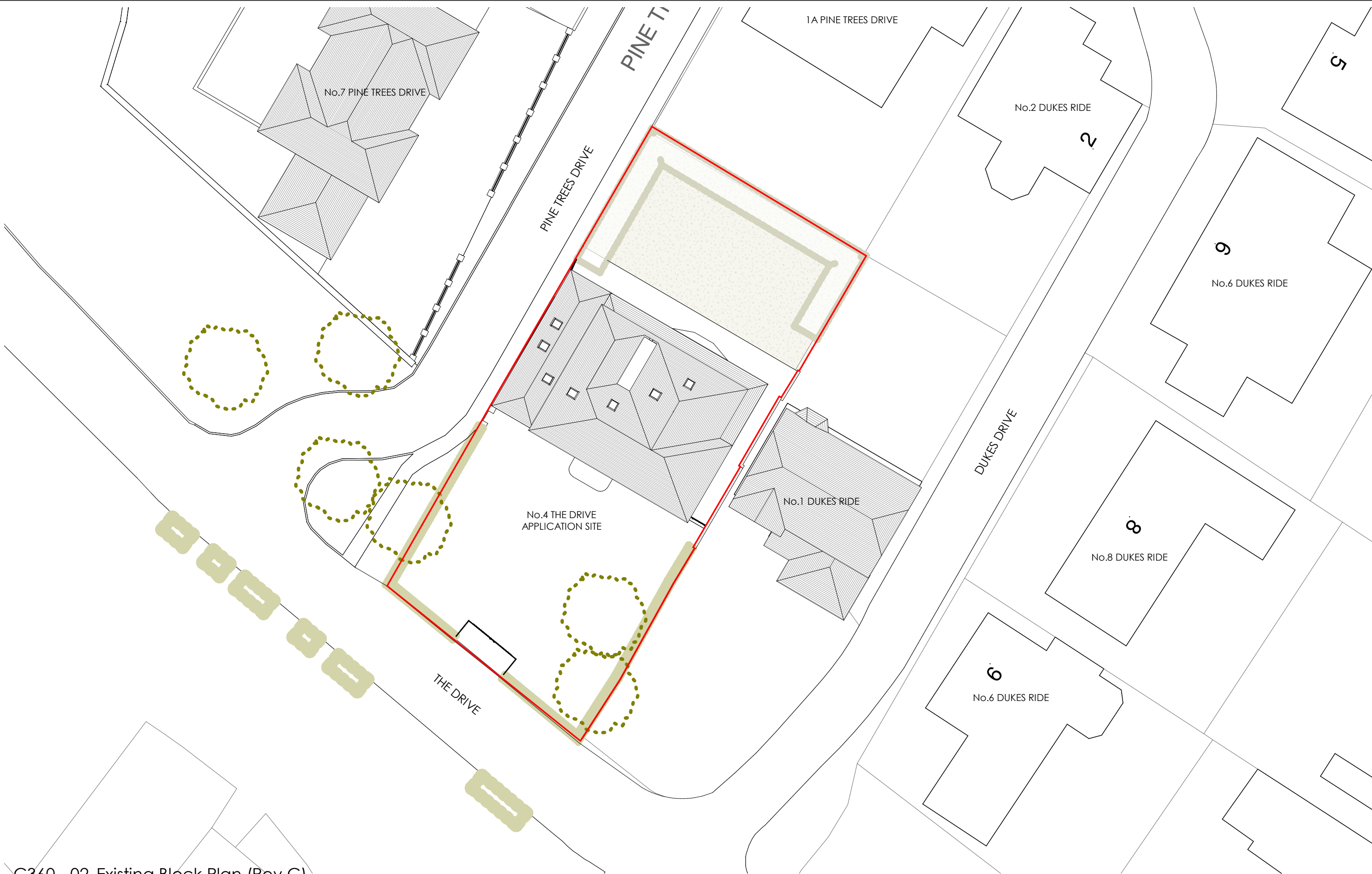
C360 - 02 Existing Block Plan (Rev C)

THE CONTRACTOR SHOULD CHECK ALL DIMENSIONS ON SITE. NO DIMENSIONS TO BE SCALED FROM THIS DRAWING (EXCEPT FOR PLANNING PURPOSES). NO PART OF THIS DRAWING IS TO BE COPIED OR REPRODUCED WITHOUT THE PRIOR CONSENT OF THE ARCHITECT. IT IS THE CONTRACTORS RESPONSIBILITY TO ENSURE COMPLIANCE WITH THE BUILDING REGULATIONS. ALL RIGHTS DESCRIBED IN CHAPTER IV OF THE COPYRIGHT, DESIGNS AND PATENTS ACT 1988 HAVE GENERALLY BEEN ASSERTED. ©