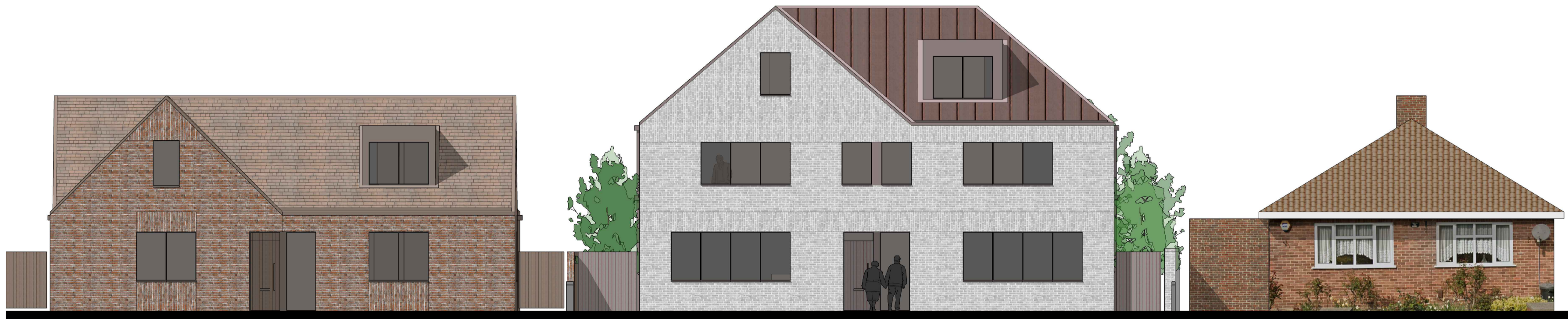
EAST ELEVATION (FRAYS AVENUE)