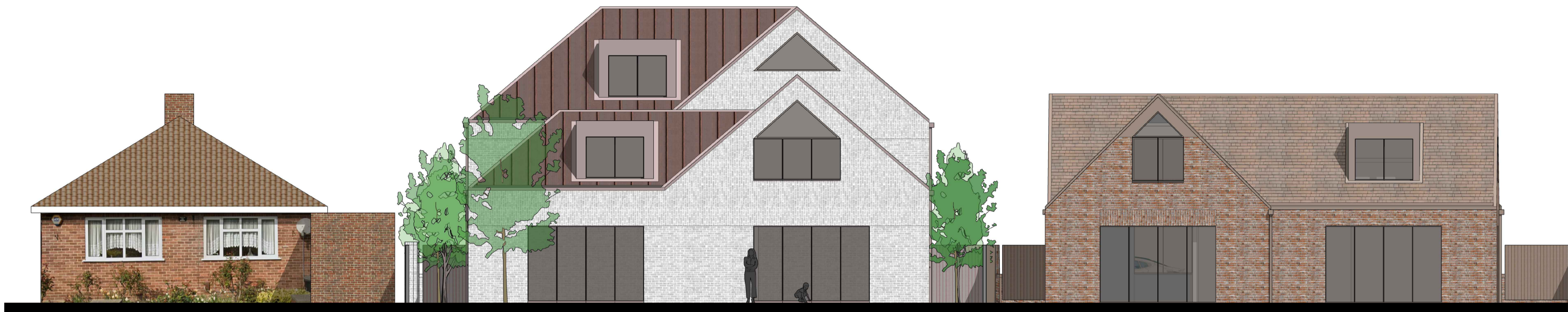
WEST ELEVATION (GARDEN)

IMPORTANT Do not work from reduced scale drawings. Please refer to scale and sheet size as indicated. Dimensions are not to be scaled from this drawing. Use only written dimensions. Consultants and Contractors must verify all dimensions before starting work and any discrepancies are to be reported to Urban View. This drawing is the property of Urban View and Copyright is reserved by them. This drawing is issued on condition that it is not copied or disclosed by or to any unauthorized persons without prior consent in writing of Urban View. Revision: Date: - - - -