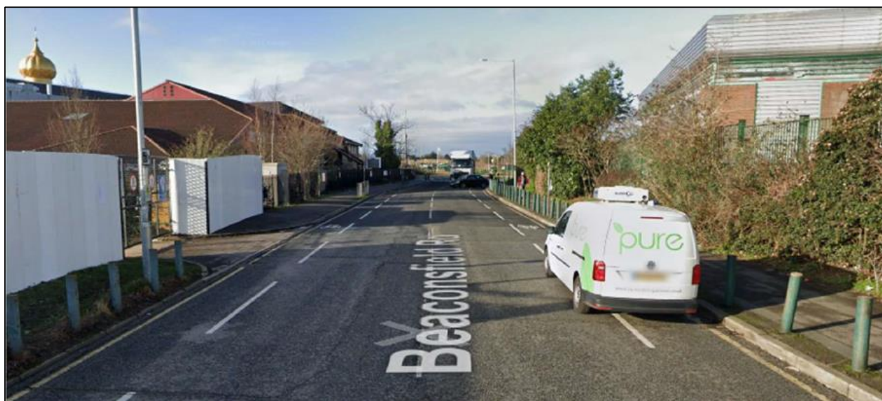
Figure 4: Beaconsfield Road

Parking along Springfield Road is controlled by single yellow lines that restricts on-street parking between of 07.30 and 18.30h Monday - Saturday. There are school keep-clear zig zag markings at the western end of Beaconsfield Road adjacent to Guru Nanak School. Figure 4 shows the on-street parking restrictions along Beaconsfield Road.