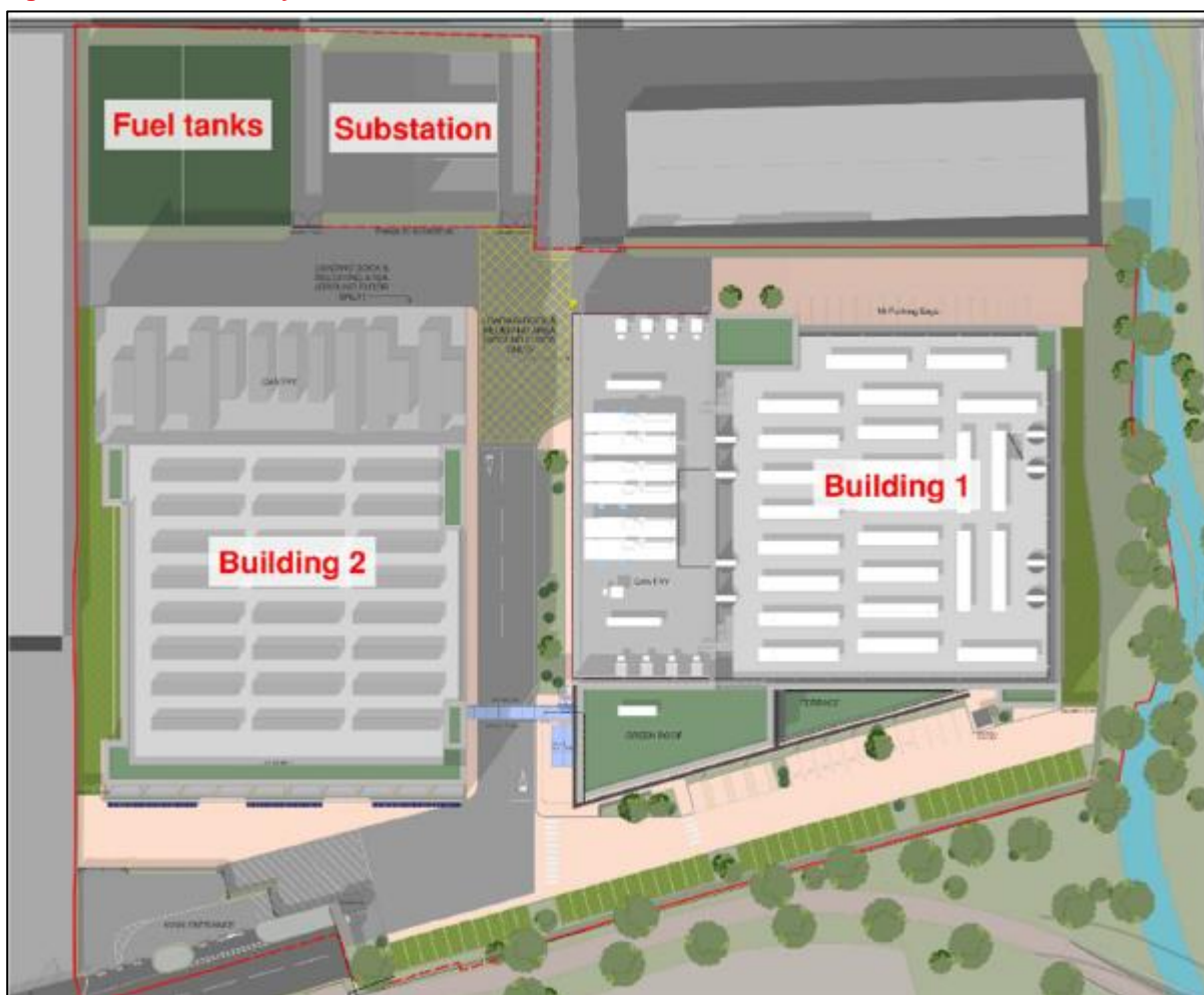
Figure 2: Indicative site layout

The site will be in operation 24 hours a day, seven days a week. It is understood that the future site would attract approximately 100 staff /contractors per day with the majority of them on site during the core working hours.