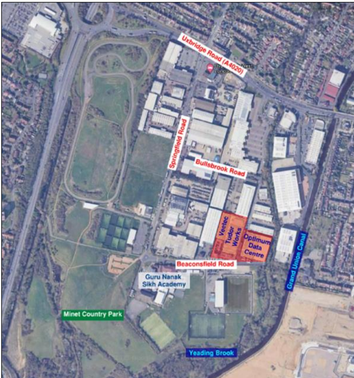
Figure 1: Site location plan