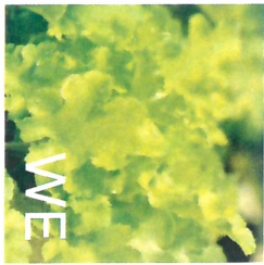
HEUCHERA 'LIME RICKEY'

Softly ruffled and ruffled lime green leaves that retain their bright colour. Small bell-shaped white flowers appear in late spring on slender stems.