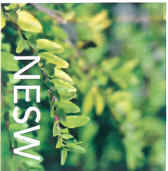
LONICERA NITIDA 'MAIGRUN'

Decorative leaves with dark leaf veins. The lobed leaves are mint green, covered with silver markings. The stems of the deep pink flowers grow longer in late spring.