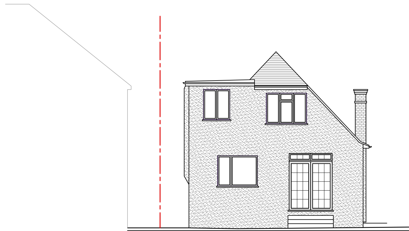
2 EXISTING REAR ELEVATION