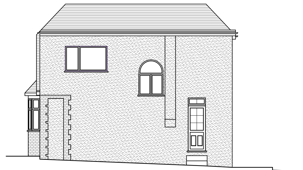
4 EXISTING FLANK ELEVATION ADJACENT TO 80 TOLCARNE